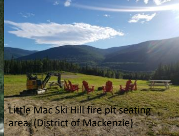
Little Mac Ski Hill fire pit seating area (District of Mackenzie)