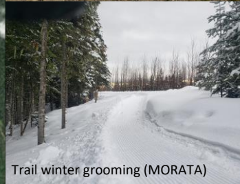
Trail winter grooming (MORATA)

A project like this provides important opportunities for a community that has been faced with multiple economic downturns. Such include: