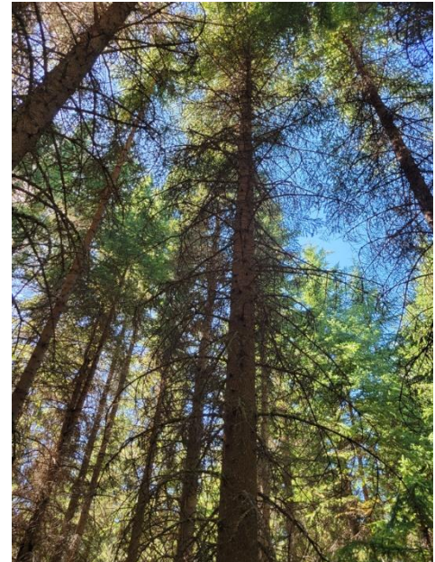
Intermediate-aged second-growth spruce stand in CNC Research Forest

Where clearcutting is undertaken or where partial cutting retains less trees than the prescribed threshold, then planting of tree seedlings or cuttings is undertaken to reforest the area. The vast majority of the reforestation actively being managed is a result of the salvage harvesting of spruce beetle attacked timber from 2016 to 2019. Currently, CNC is managing approximately 3,400 ha of stands that are non-free growing, planted forests. The total amount of non-free growing area is expected to decrease steadily, each year in the foreseeable future, as substantial additional cutblock area is assessed for free growing, while comparatively little harvest area is added.