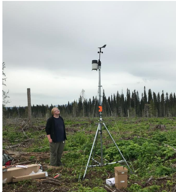
Climate station installation within Research Forest Unit K (Willow River)

This collective CNC employee effort and funding support from the CNC Research Forest Society is maintaining a continuous CNC capacity to undertake a breadth of applied research and innovation projects focused on natural resources and forestry while ensuring improved educational opportunities for NRFT students. For multiple years, this effort has allowed CNC to plan and implement a high number of concurrent applied research projects with regular CNC student involvement. In the upcoming years, CNC is expecting a significant increase in new applied research projects, involving external research funding and additional partners throughout the CNC Region.