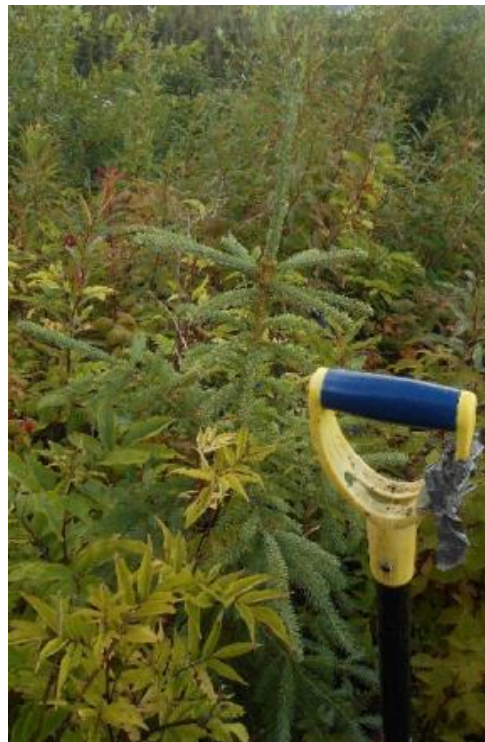
Planted trees surveyed in Cutblock A-2 during 2022

A report generated from RESULTS is included within Appendix A to demonstrate that provincial reporting of the cutblocks, listed in the previous paragraph, has occurred. In addition, CNC harvested three cutblocks under the authority of Woodlot W0210, which are now within the area under the Research Forest tenure. These cutblocks are also reported to RESULTS and included in Appendix A.