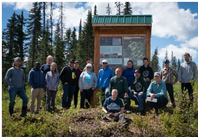
Tour of CNC Research Forest during June 2022

Over multiple years, these research-related employment opportunities have substantially contributed to the natural resource training and work experience being offered through CNC, which is directly or indirectly linked to the CNCRFS and operation of the CNC Research Forest. In 2023, it is expected that 5 natural resource students will be hired for engagement in research related projects. During 2023/24, CNC and the CNC Research Forest Society are collaborating on significant, new funding to strengthen and renew the CNC capacity for new applied research in forest resources. With this new investment, the employment of CNC NRFT students and other natural resource students is expected to rise in 2024 and beyond.