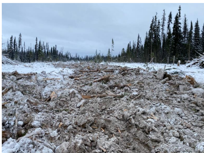
Winter road rehabilitation, Research Forest Unit K

The CNC Research Forest has accumulated a notable amount of built roads with the salvage harvesting undertaken from 2016 to 2019. The long-term road maintenance obligations were substantially reduced by prescribing many roads as temporary and subsequently completing road rehabilitation. For the remaining permanent roads, the CNCRFS has established a contingency fund for continuing road liabilities. This ensures that a portion of the surplus revenues from Research Forest operations will always be available to either CNC or the Province to fulfill road maintenance or deactivation obligations, as necessary.