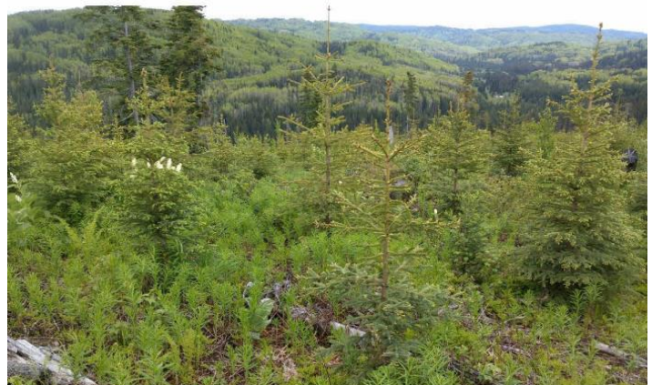
Free growing stand within Cutblock E-1 (Chuchinka Creek area)

With the accumulation of large salvage harvesting areas since 2016, the CNCRFS has established a silviculture liabilities fund to cover the cost of outstanding silviculture activities necessary to achieve free growing standards on all harvested areas. This ensures that a portion of the surplus revenues from Research Forest operations will always be available to CNC or the Province to fulfill reforestation obligations, as necessary. The silviculture liability fund is expected to steadily