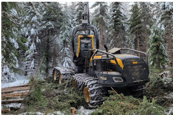
Ponse harvester falling and processing trees in partial cut (patch cut) within Research Forest Unit D, during December 2022.

An experimental harvest was conducted during early winter (2022-23) within Research Forest Unit D. The harvest was designed to improve biodiversity and wildlife habitat within two 35-year old, second-ground spruce stands. The treatments were designed as small patches cuts interconnected with narrow (5m) trails. The prescribed harvested/treated area was small in order to maintain equally large, comparable control areas within each spruce stand.