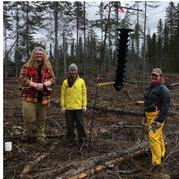
Experimental spruce beetle funnel trapping trial, 2022

During the summer of 2022, new climate stations, with soil moisture monitoring, were established within Research Forest Units J (Blackwater), K (Willow River) and Unit L (Willow River). The data from these climate stations will provide reliable weather data for future research projects and support future climate change studies and analysis undertaken by the Ministry of Forests and CNC Instructor, Stephane Dube.