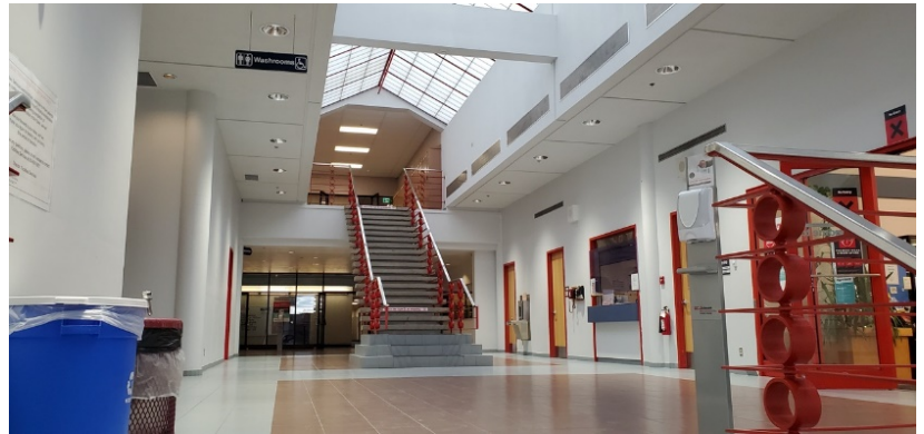
2 nd floor landing with 2 nd floor library windows down stairway towards main entrance (southeast)