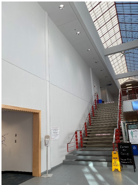
Inside main floor— west wall stairway wall