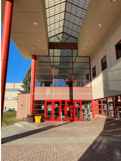
Outside entrance (looking north)