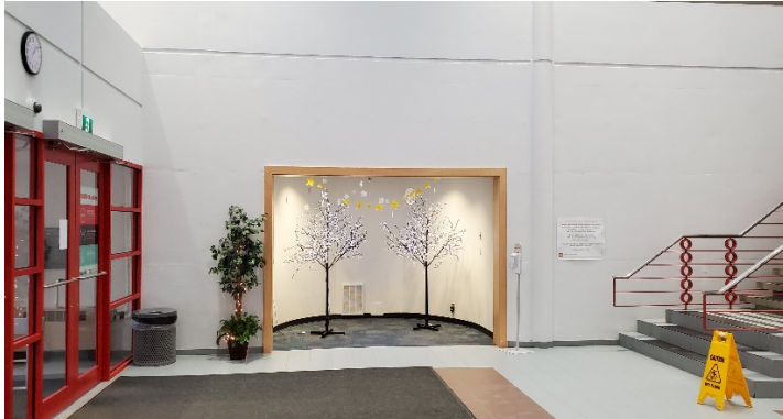
Inside main floor – under 2 nd floor landing (south)