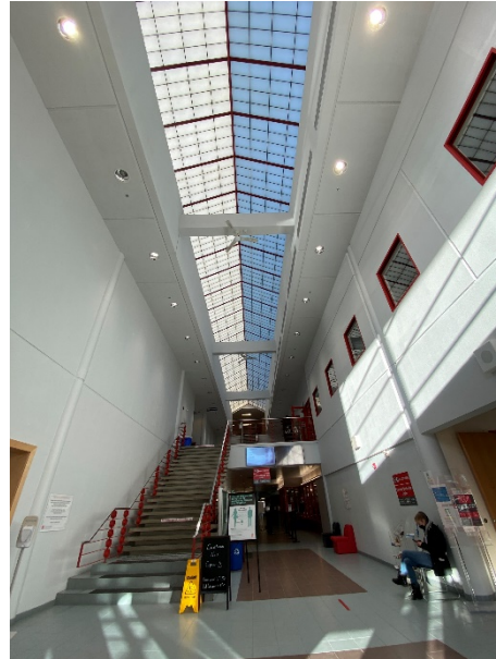
Inside main floor (north)