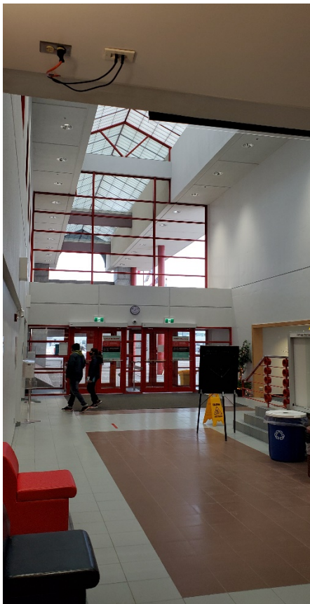
Inside main floor – under 2 nd floor landing (south)