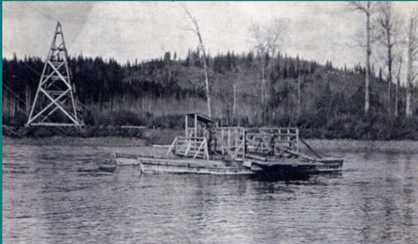
Ferry on the Nechako River