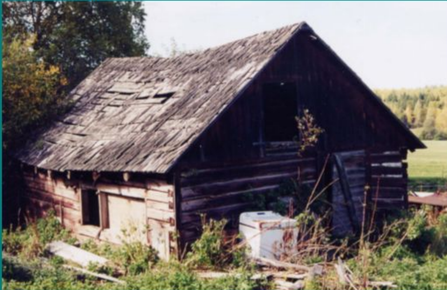
Barn built by Goglines, later used by Geislars as chicken barn