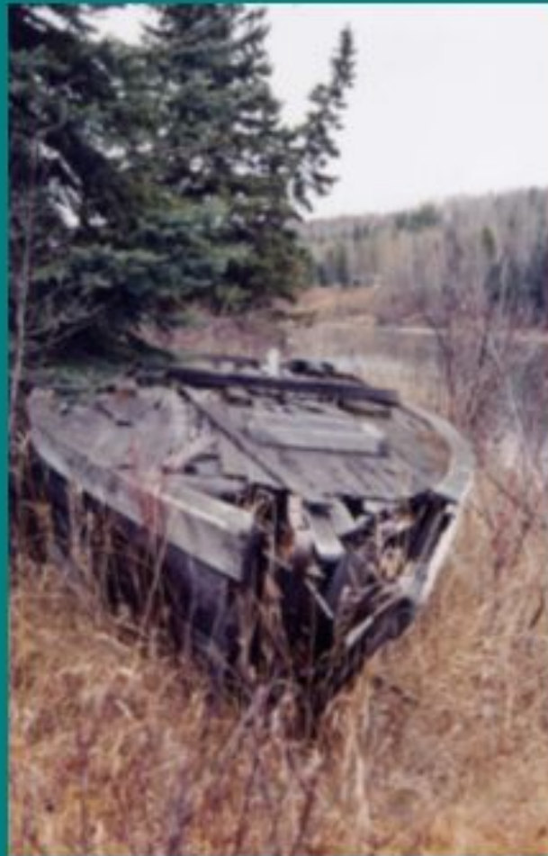
One of the two remaining pontoons of the Nechako ferry at Miworth