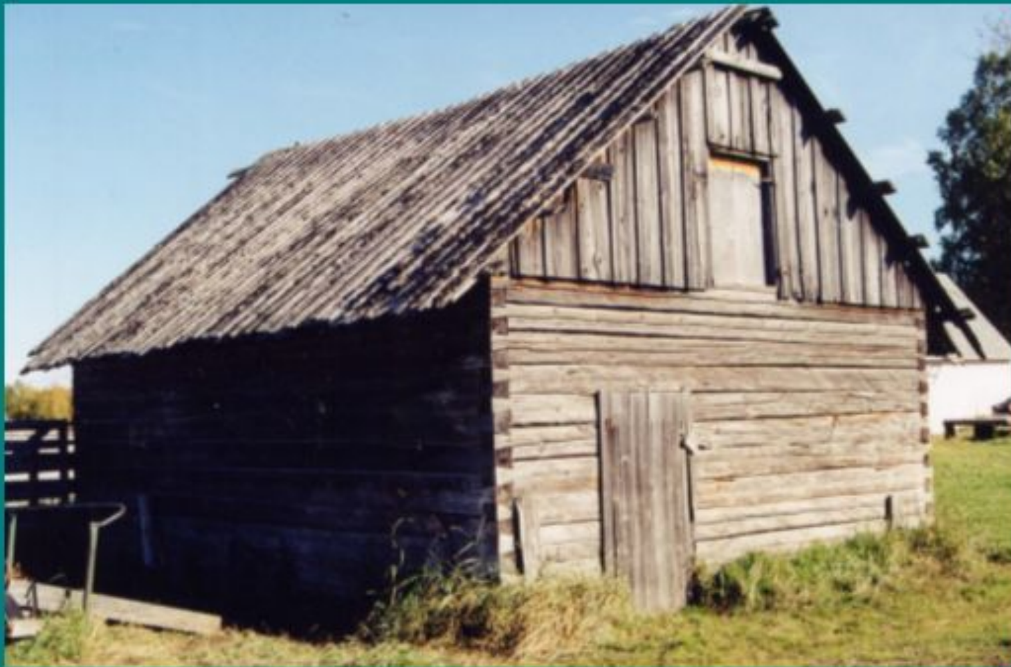
Hildebrandt barn or shed