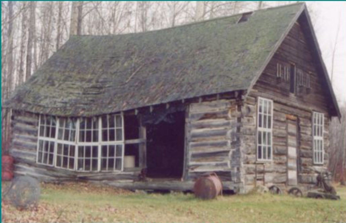
Cranbrook Hill School