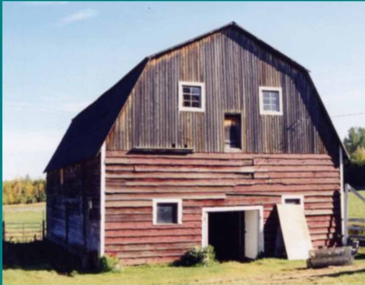
August Fichtner's barn built in early 30's