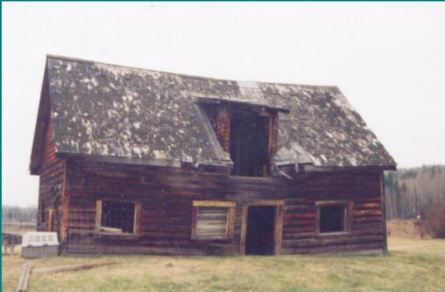
Matt Androlang's house on Otway Road