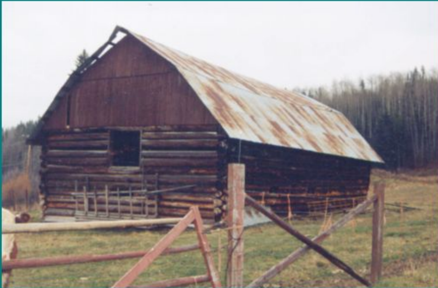
William Hrechka barn on Otway Road built in 1926