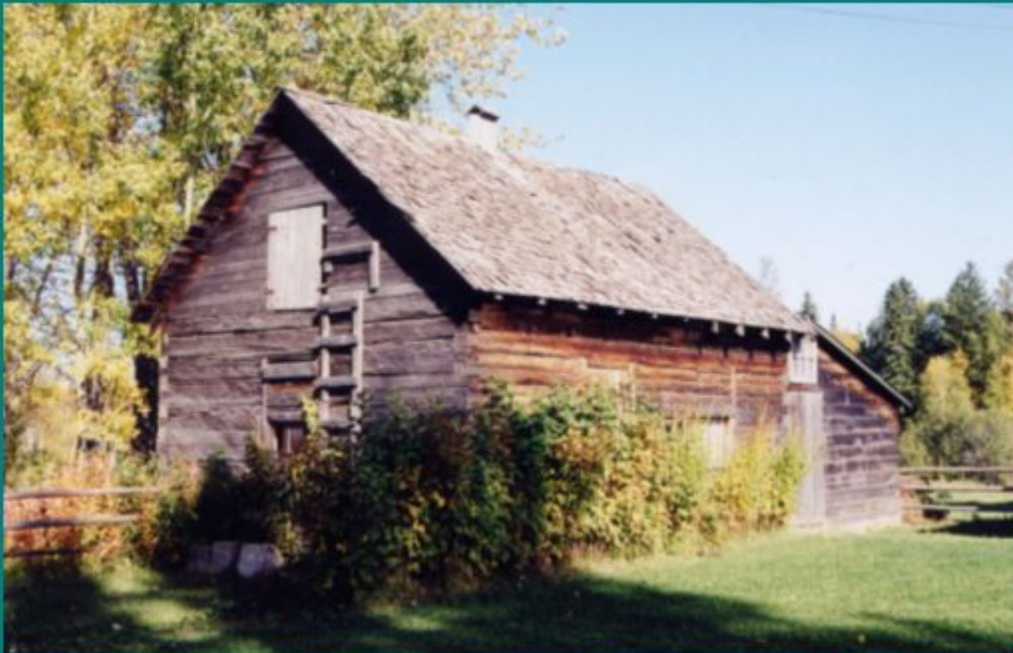
Kueng house as it looks today