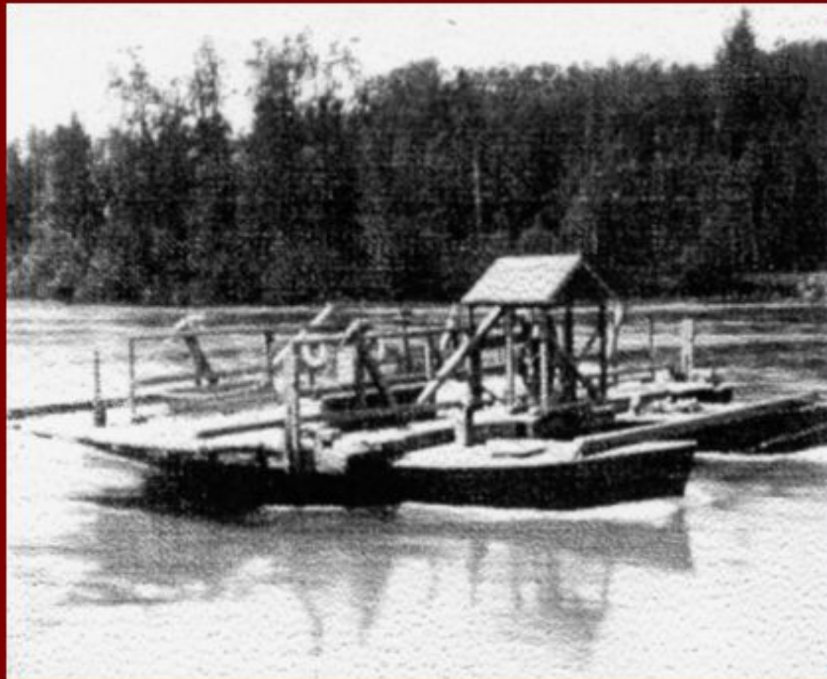
Isle Pierre ferry