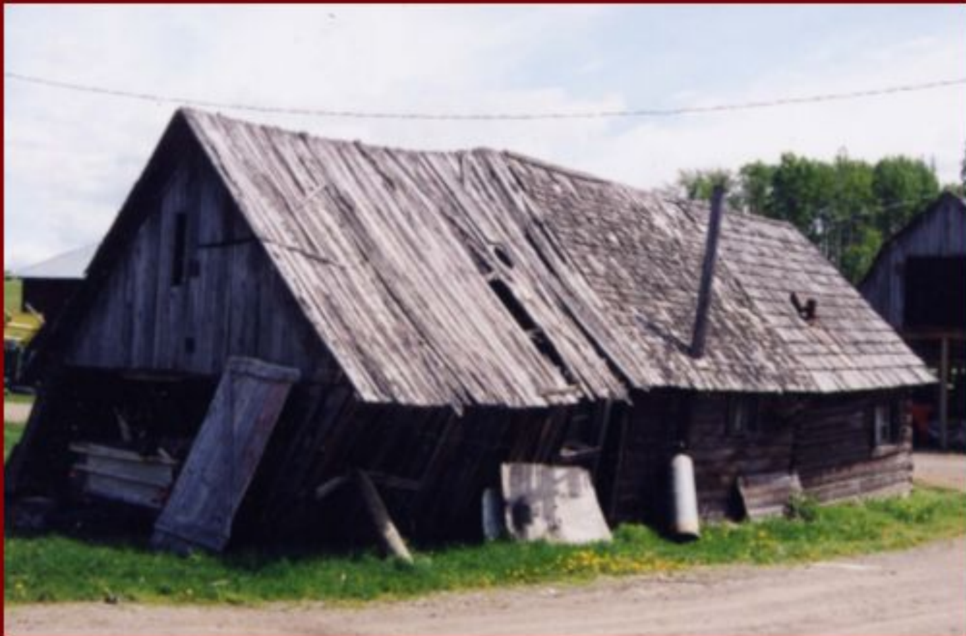
On the Kucey farm