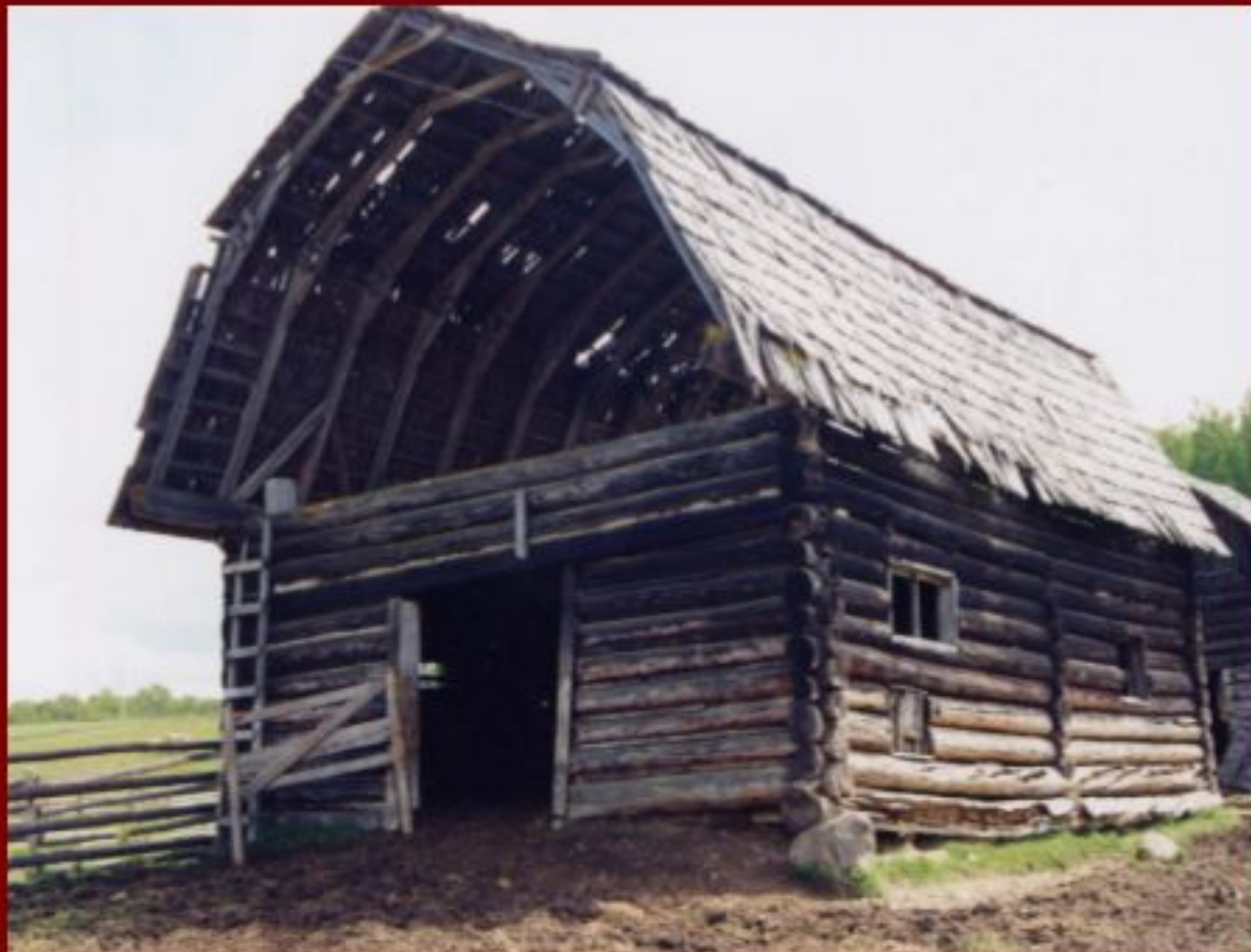
Kucey horse barn