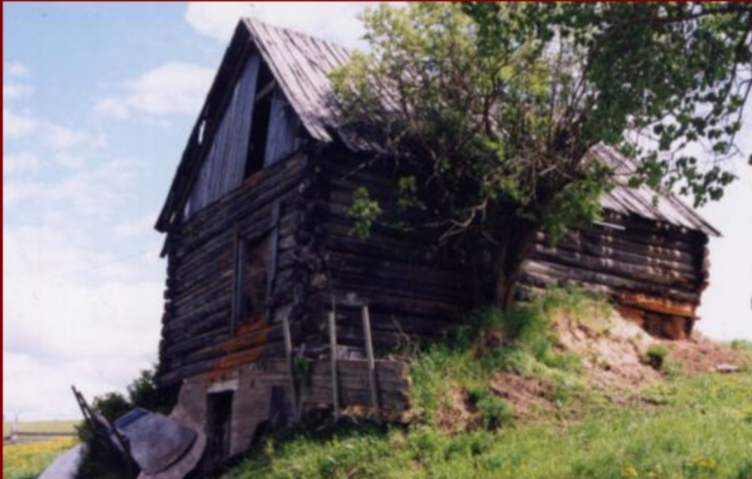
Root house built into side of hill by Kucey brothers and friends