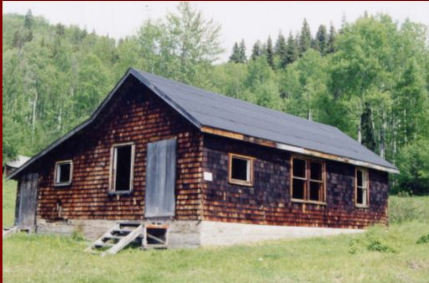
Anderson house built by Isle Pierre river crossing on the north side