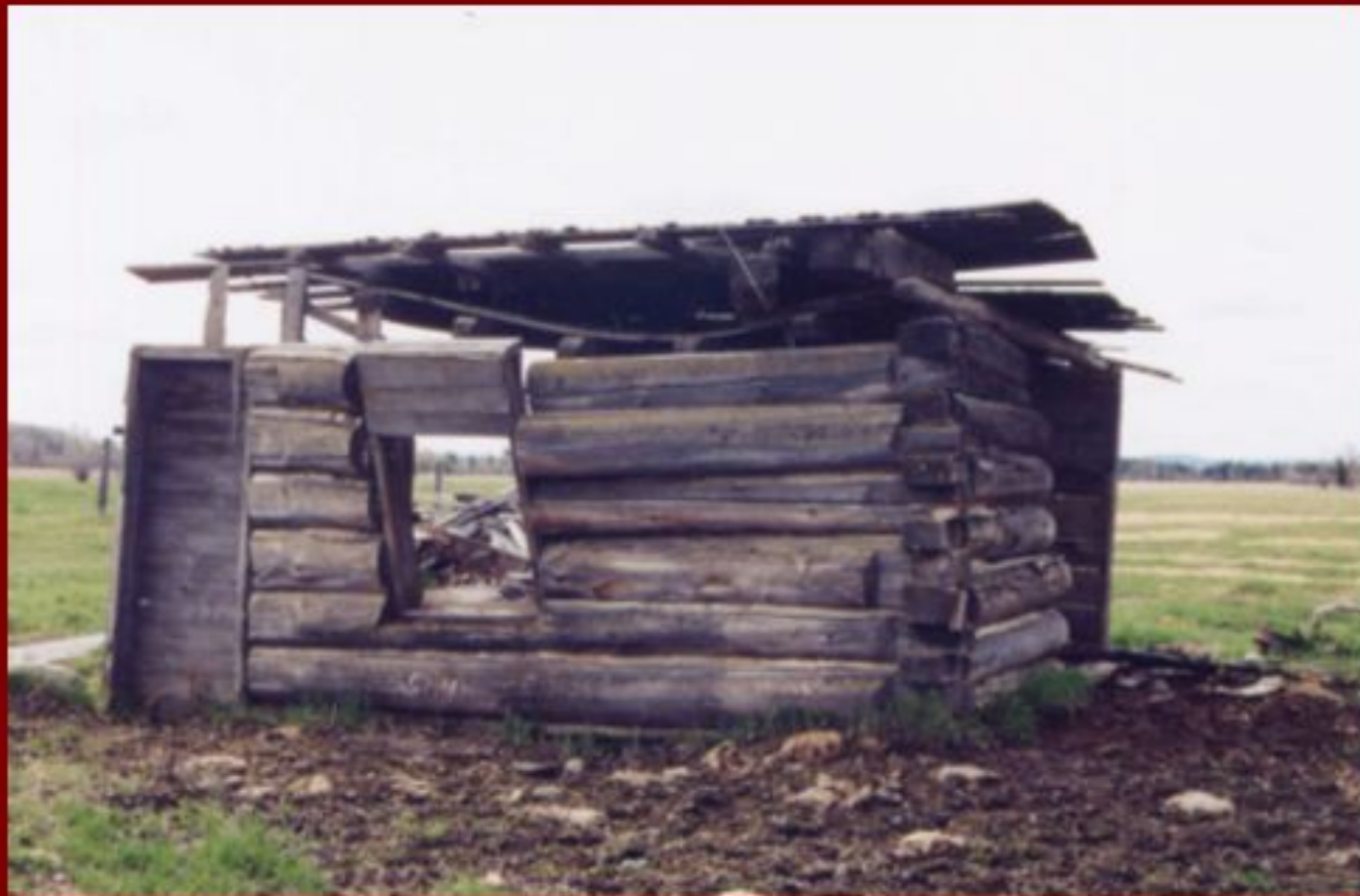
Remains of a log building at Cook's homestead