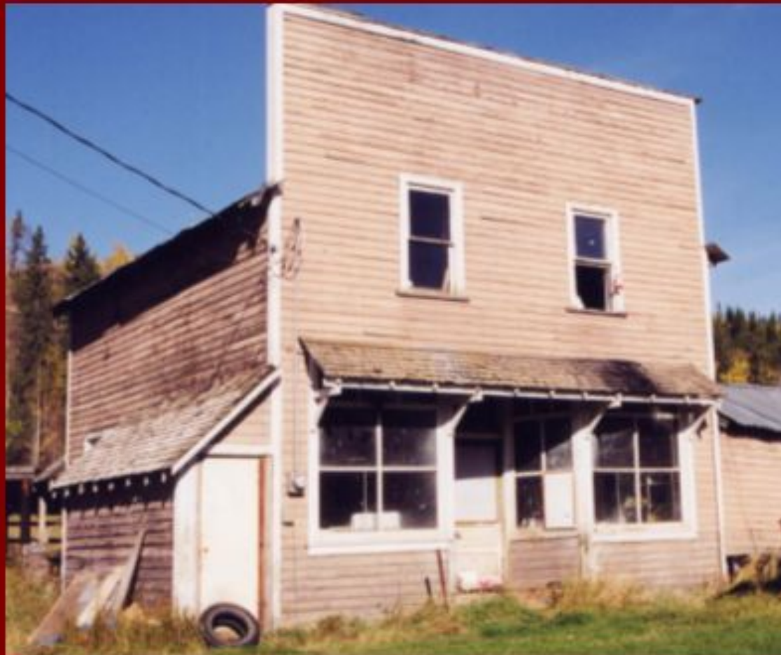
Isle Pierre frame store built by J.R. Boyd