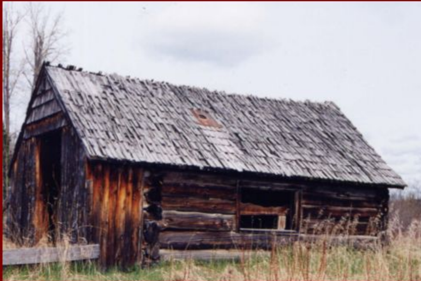
Frank Brink's cabin on Isle Pierre Road