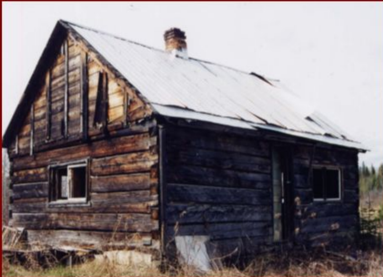
Douglas-McCabe house on Isle Pierre Road