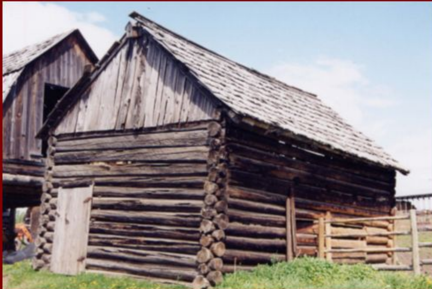
Salt and feed shed at Kucey's