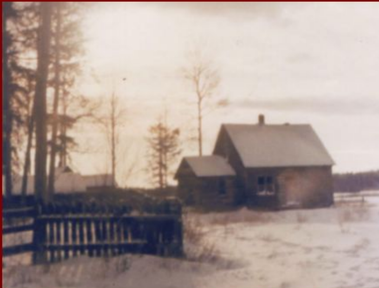
The Cook homestead on Isle Pierre Road