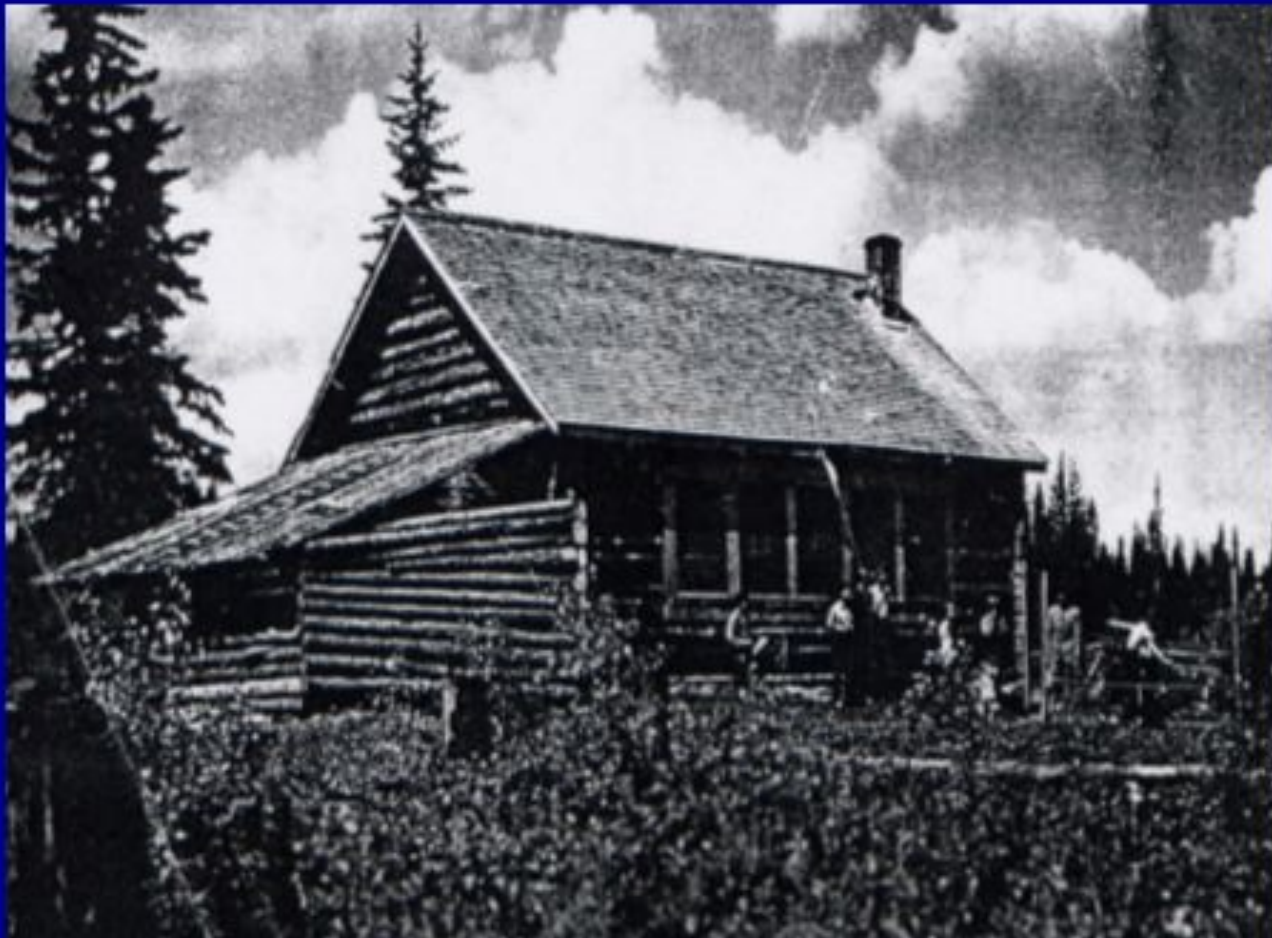
The original Ness Lake School