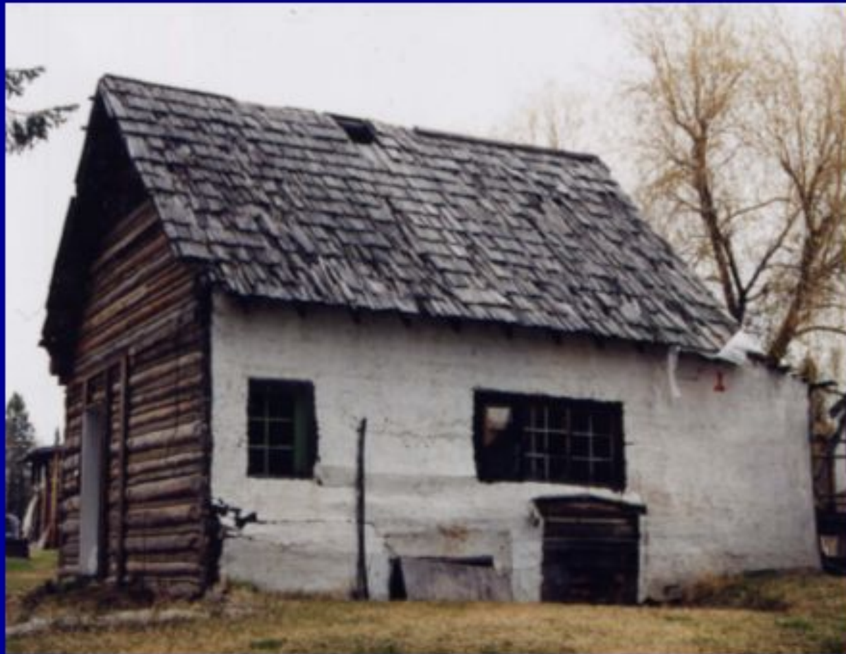
The Estes house, part plastered and part logs showing now