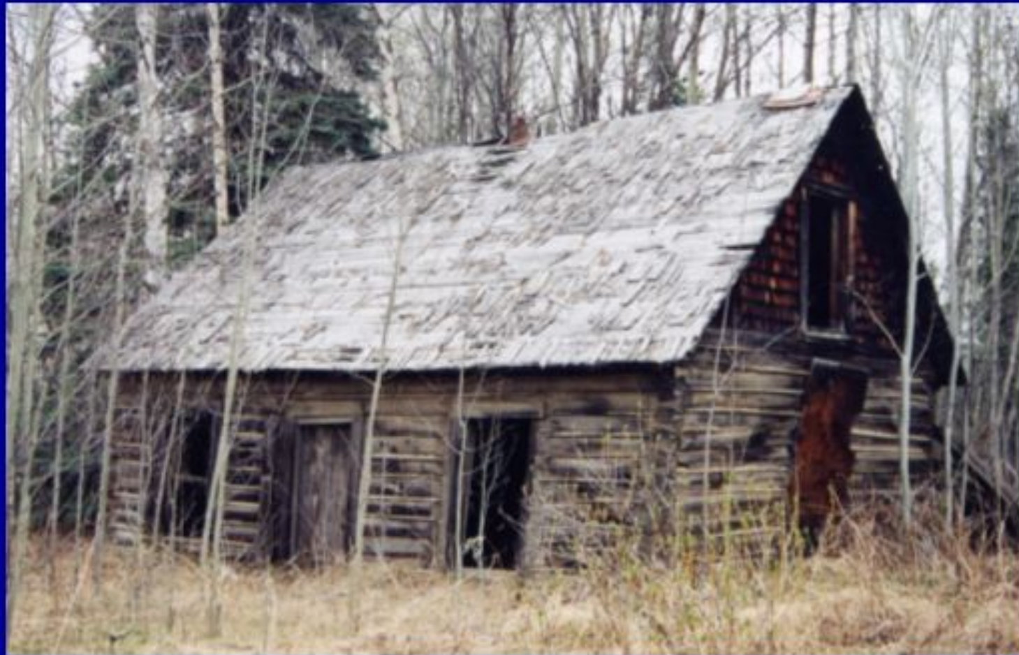
Scott house on Reid Lake Road built in 1930