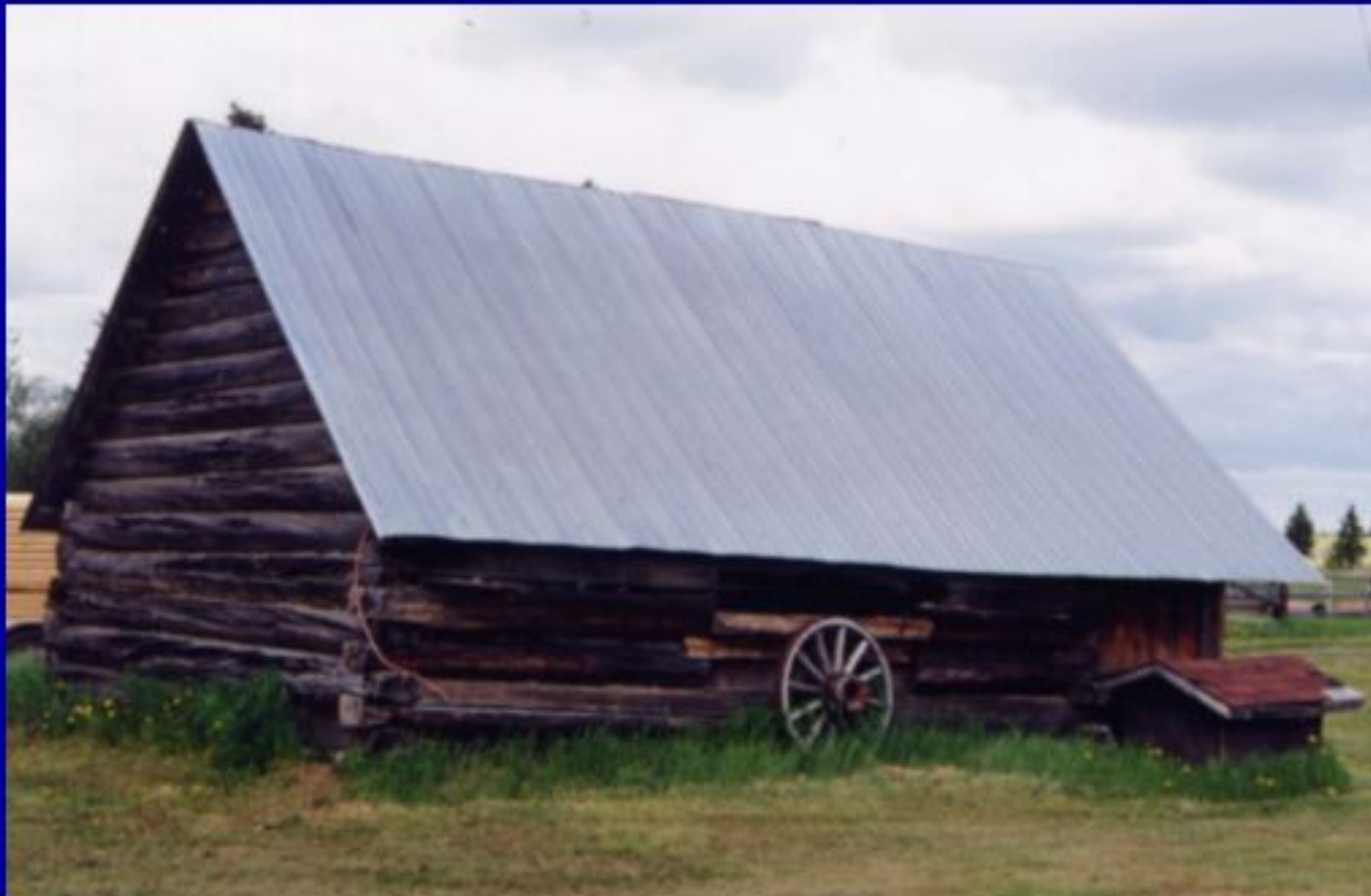
Trapper cabin on Ed Hamer's place