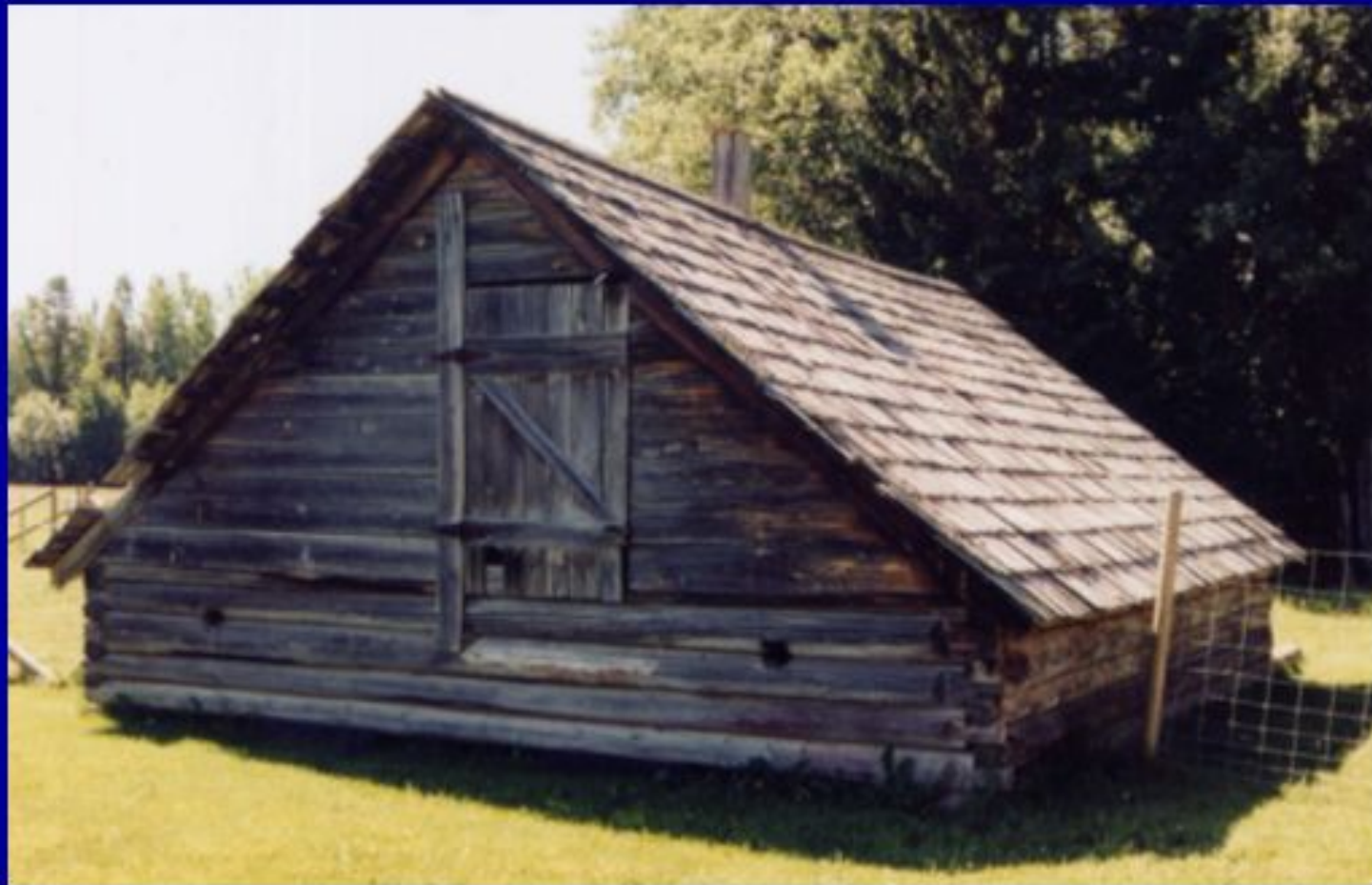
George Robbins barn, built in 1933-34. Lower logs have rotted into the ground