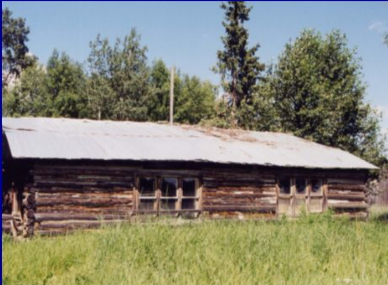
The Greengrass house on Chamberlain Road