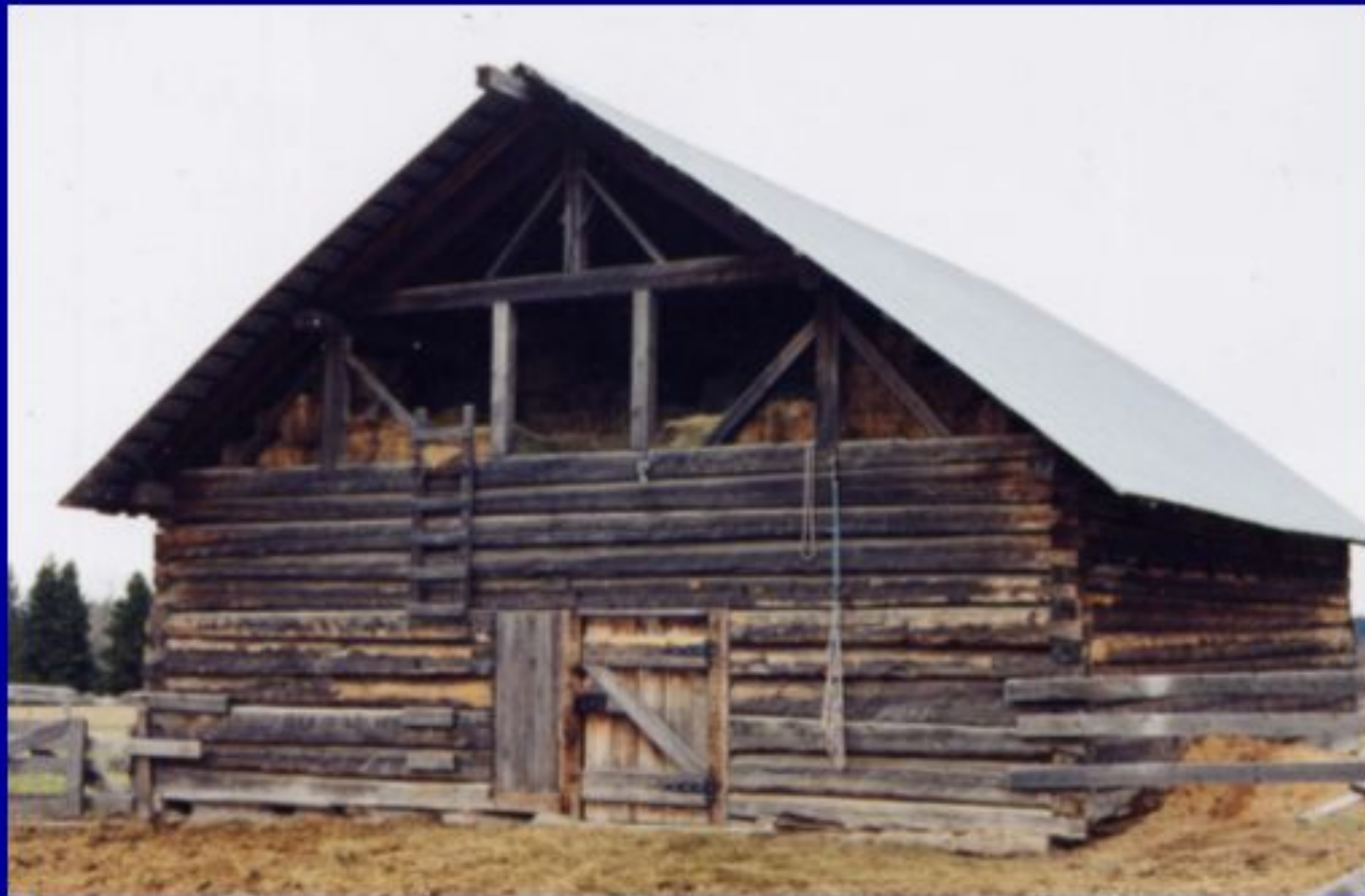
The Barrett-Rigler barn, built from the Ness Lake School logs