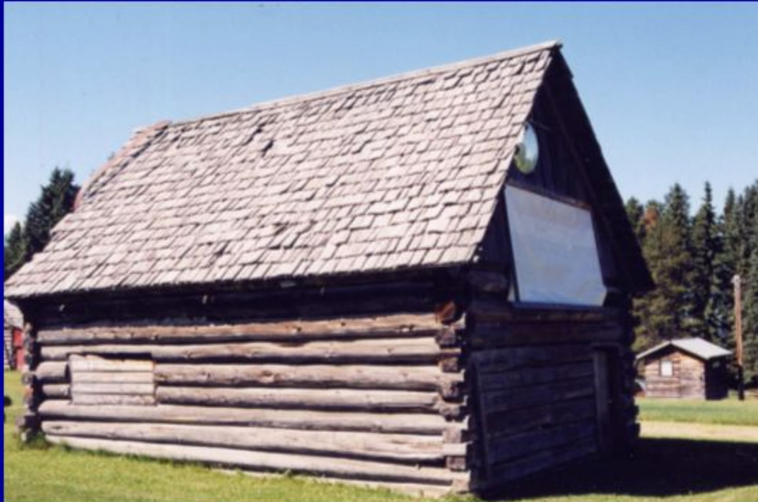
George Robbins house, likely used as tie camp later. Built in 1933-34