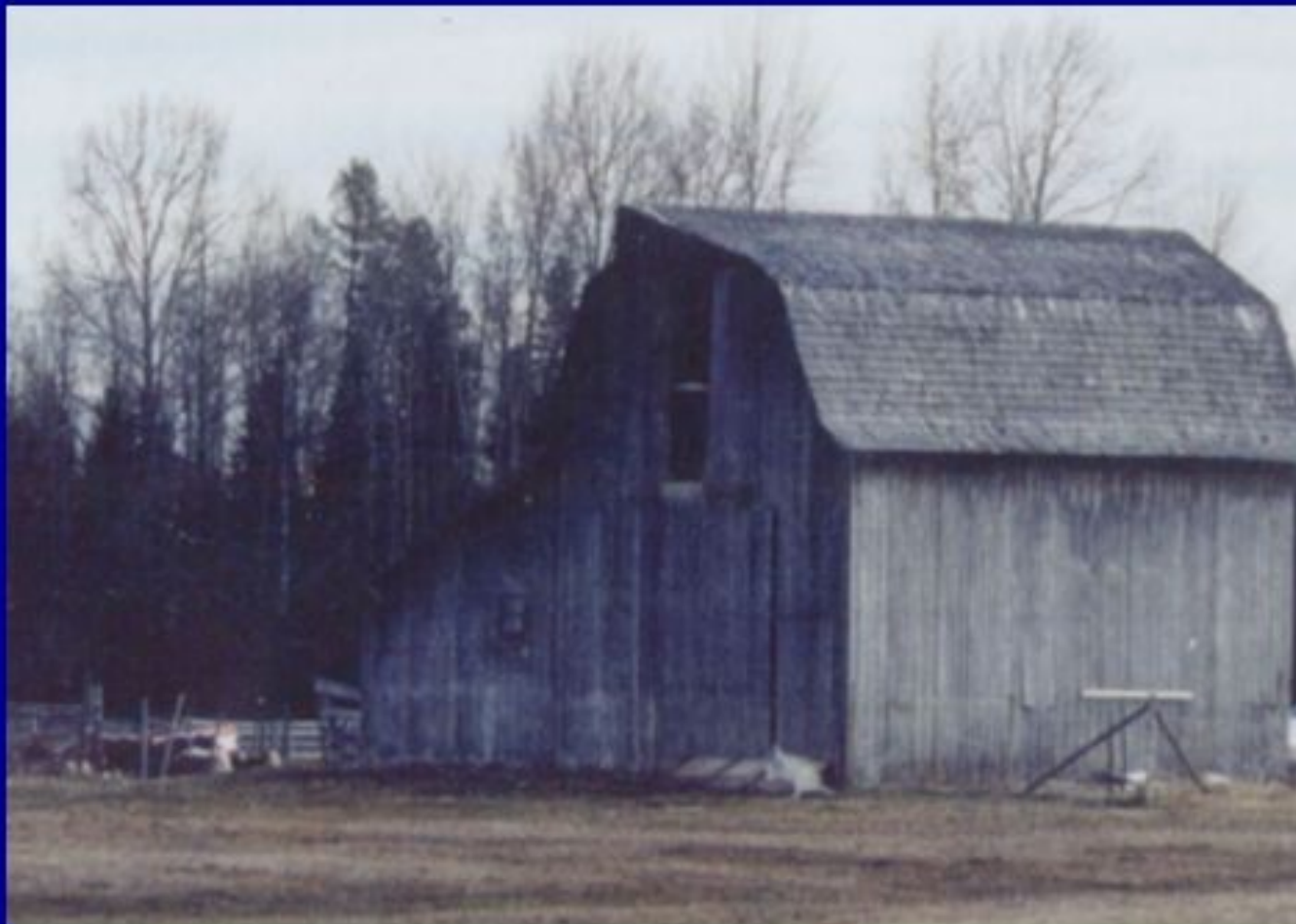
Jarvis barn on Reid Lake Road