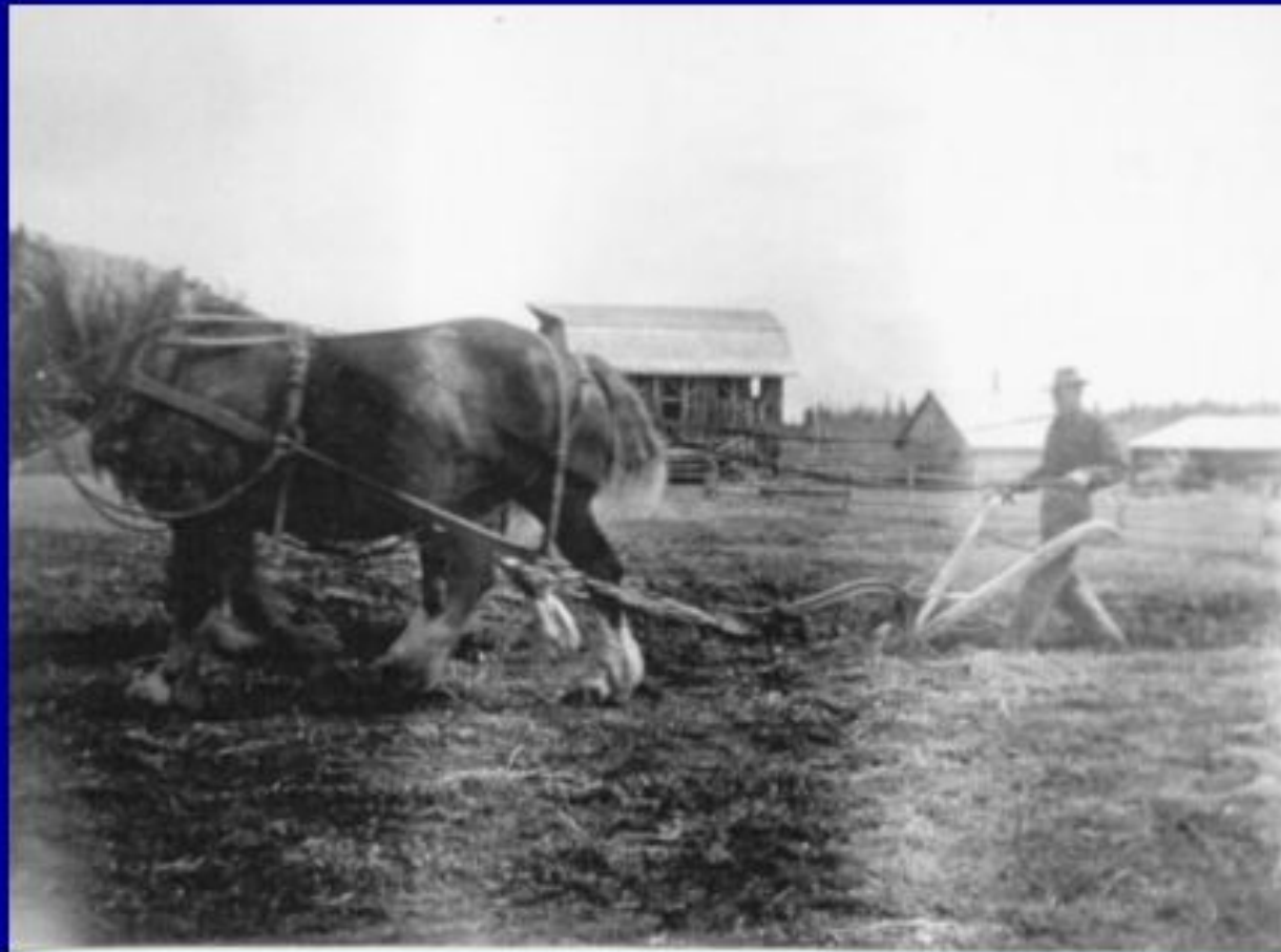
Harold Jarvis plowing with horses and a walking plow