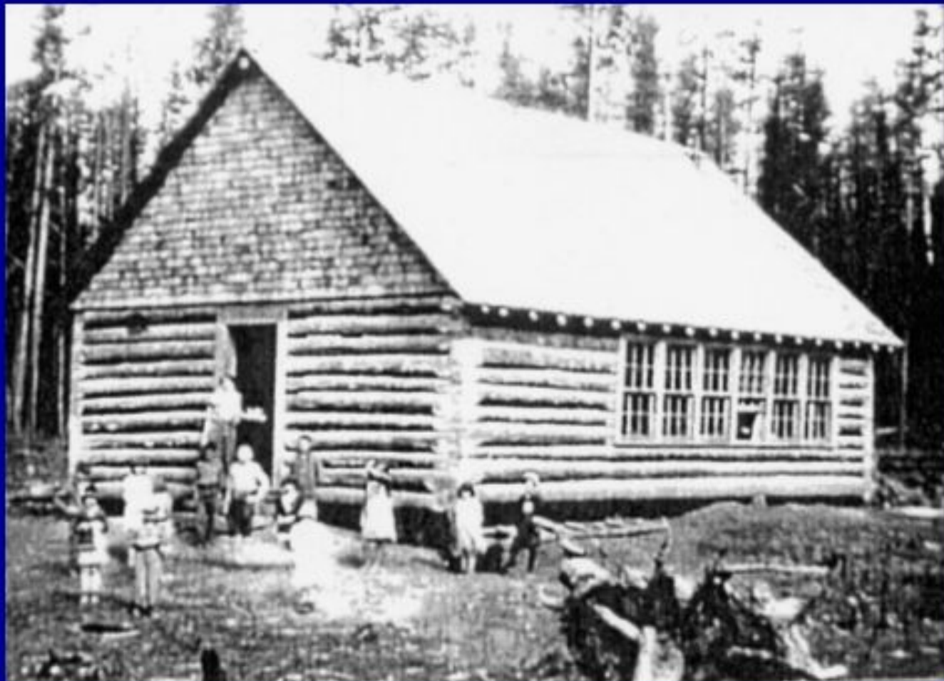
Sylvan Glade School 1931-32