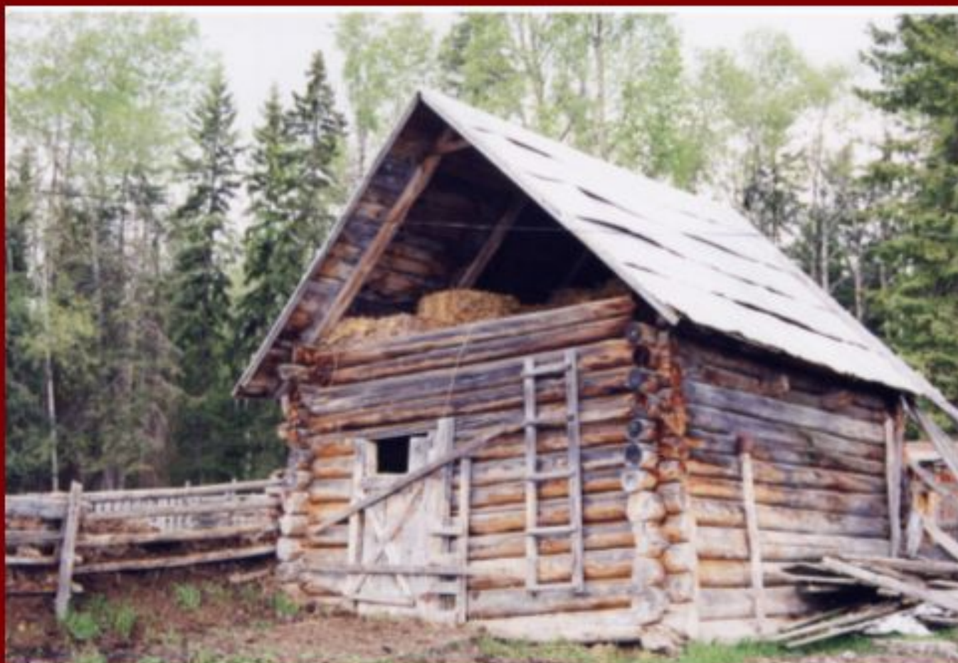
Little barn built by Rudolf Kwiatkowski