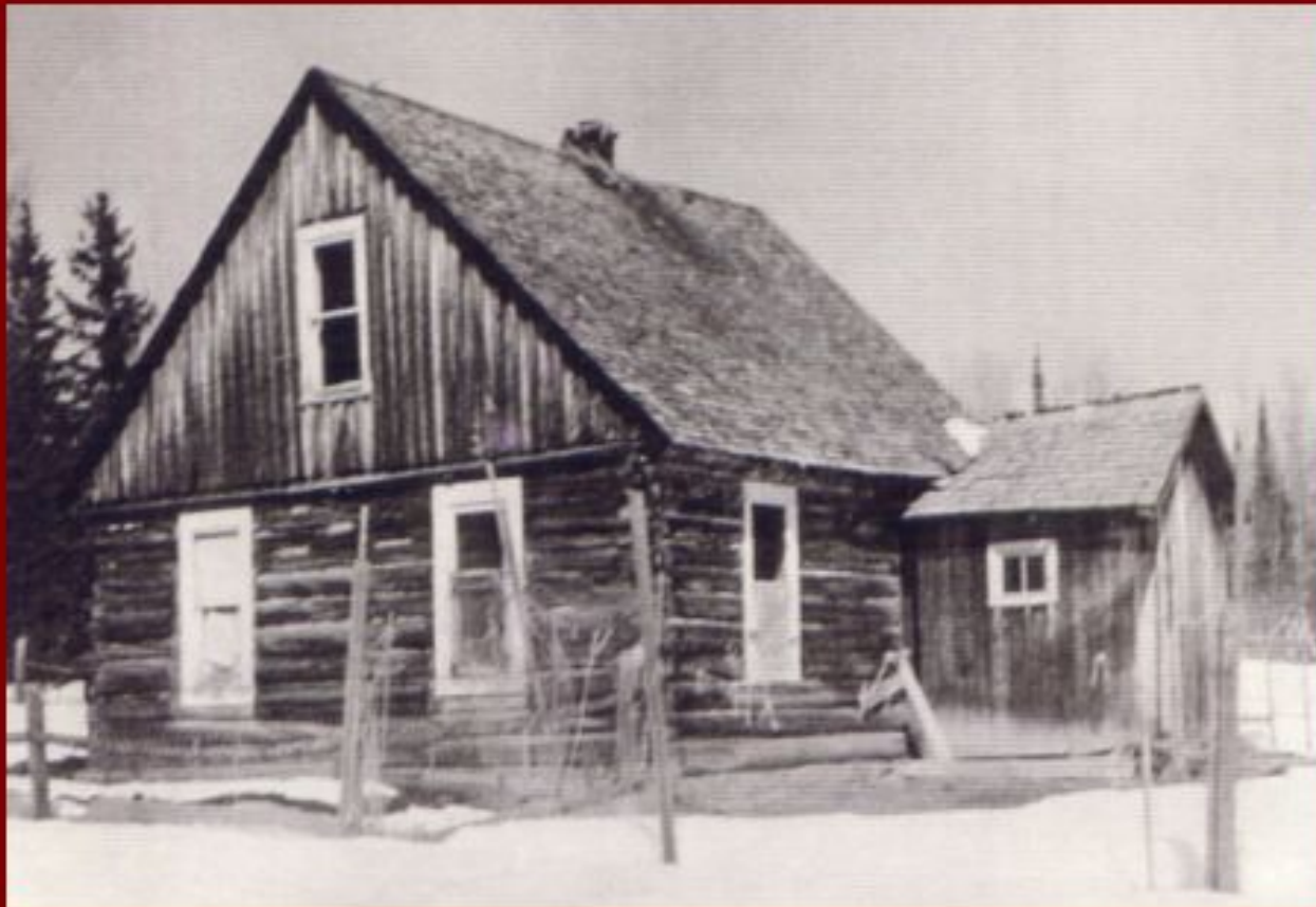
House built by Willie Teshke and later moved onto the Kwiatkowski farm on Six Mile Lake Road