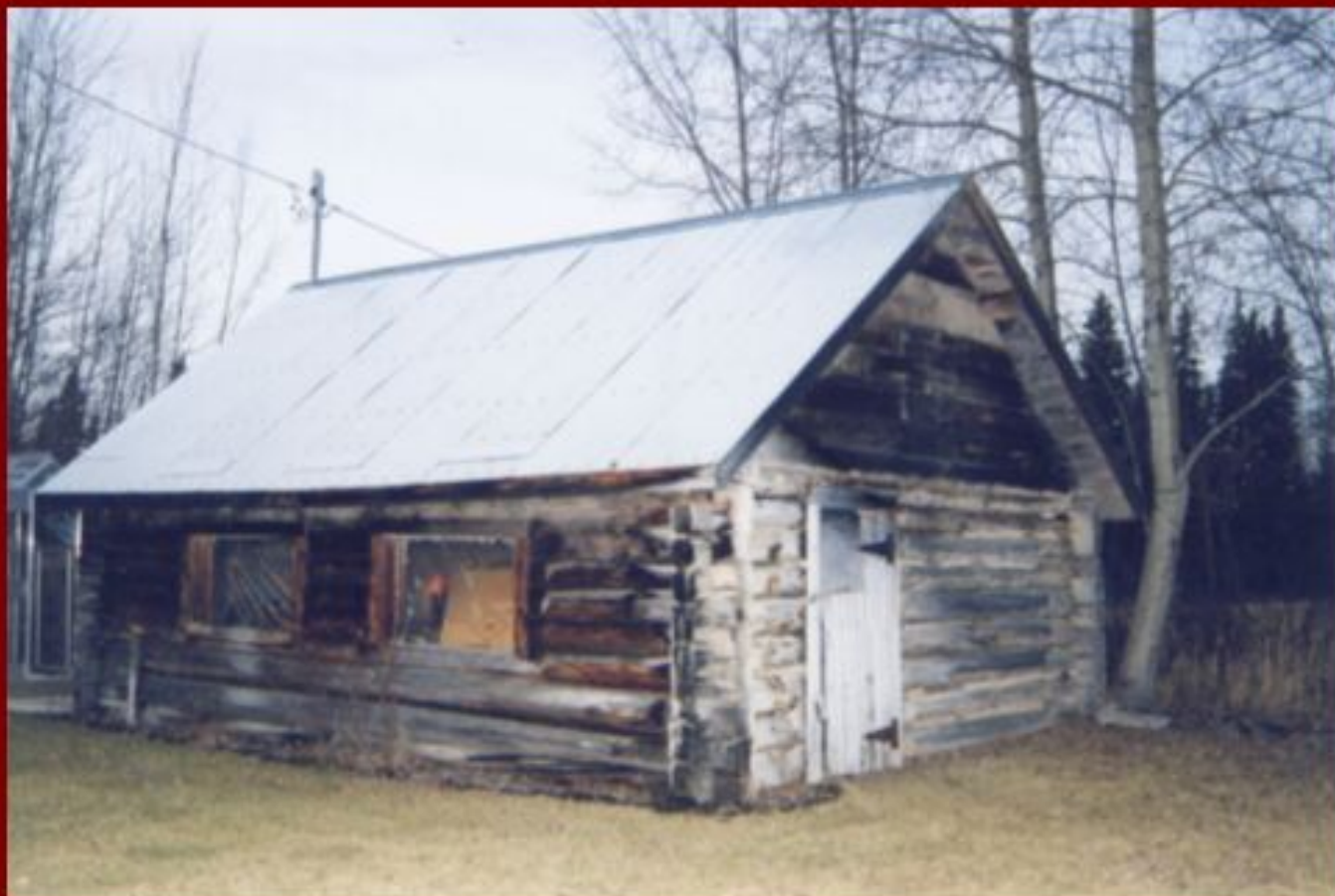
The cabin that the Sowpals built on Havilland Road across from the first quarter