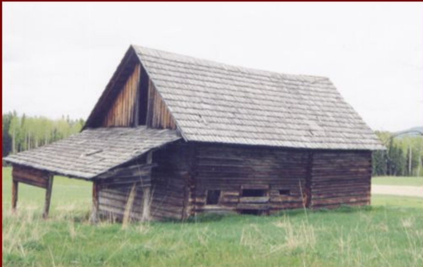
Arseniuk's barn on Six Mile Lake Road