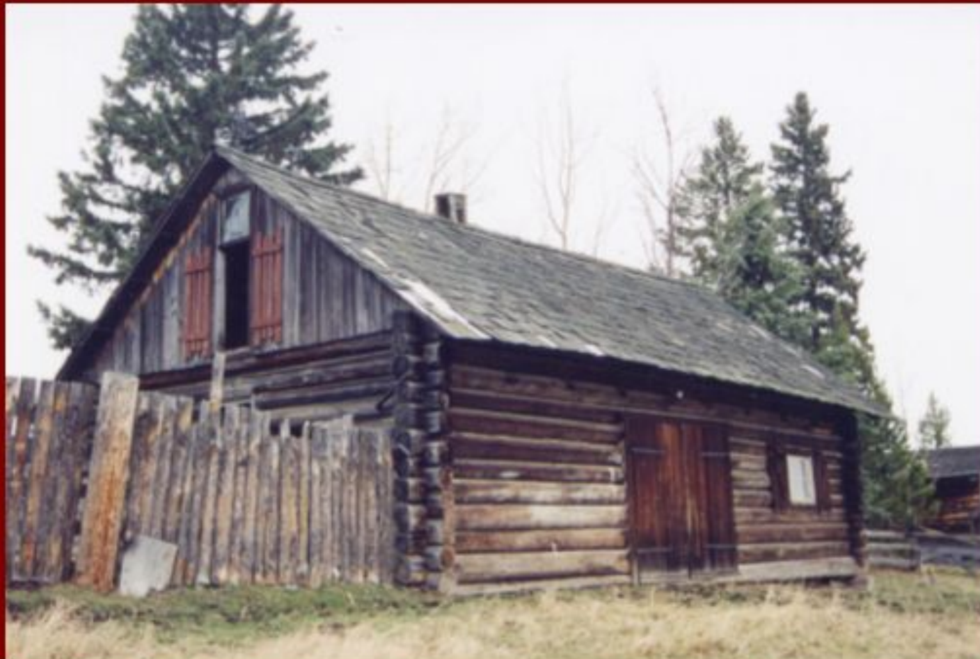
Griffiths-Schlitt-Bonnet house across from the Blackburn Hall