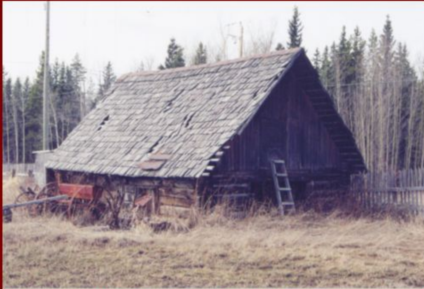
Michalchyshyn's chicken house