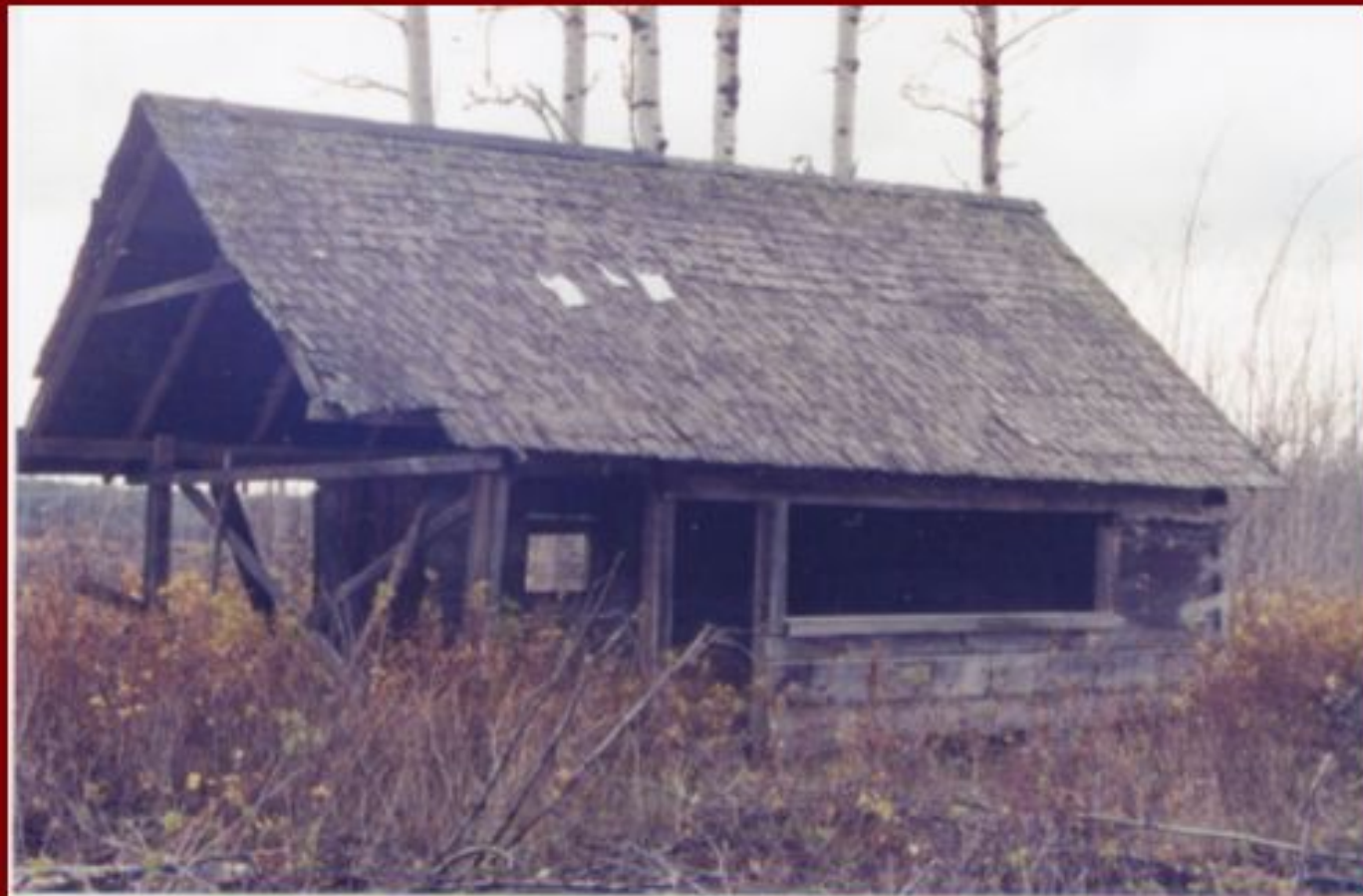
Pankew barn. Highway 16