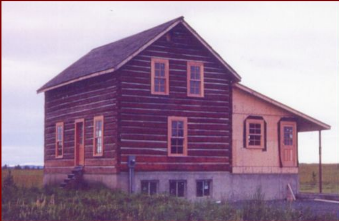
The restored Blackburn house