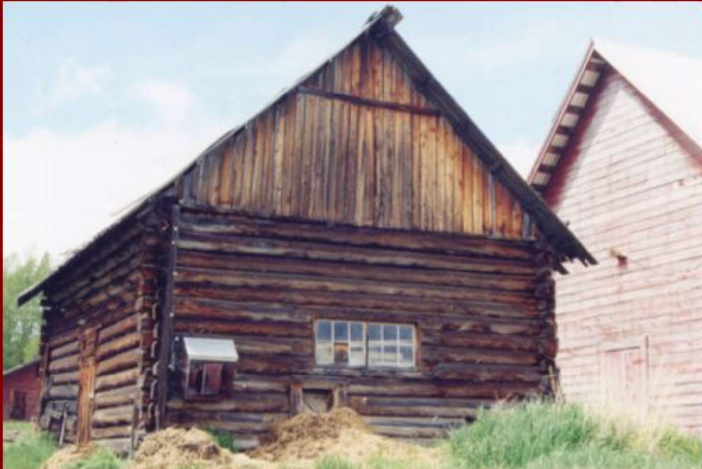
Barn built by Otto Teshke