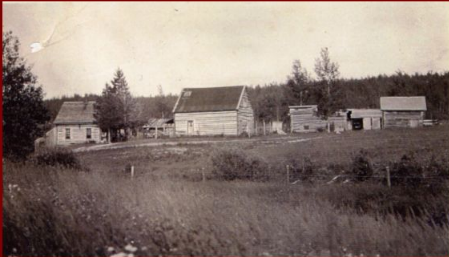
The Schlitt homestead