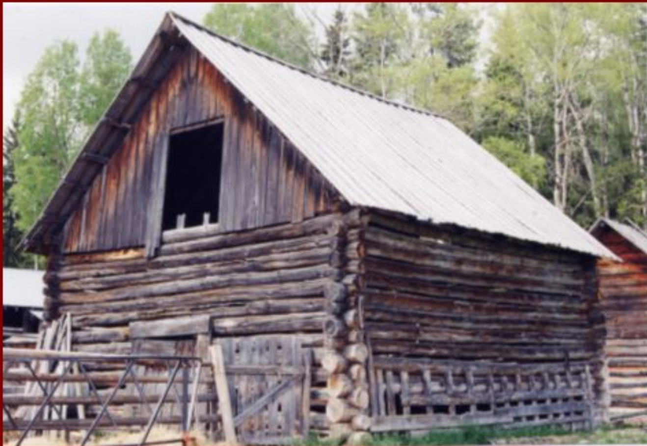
Willie Teshke's barn on Six Mile Lake Road