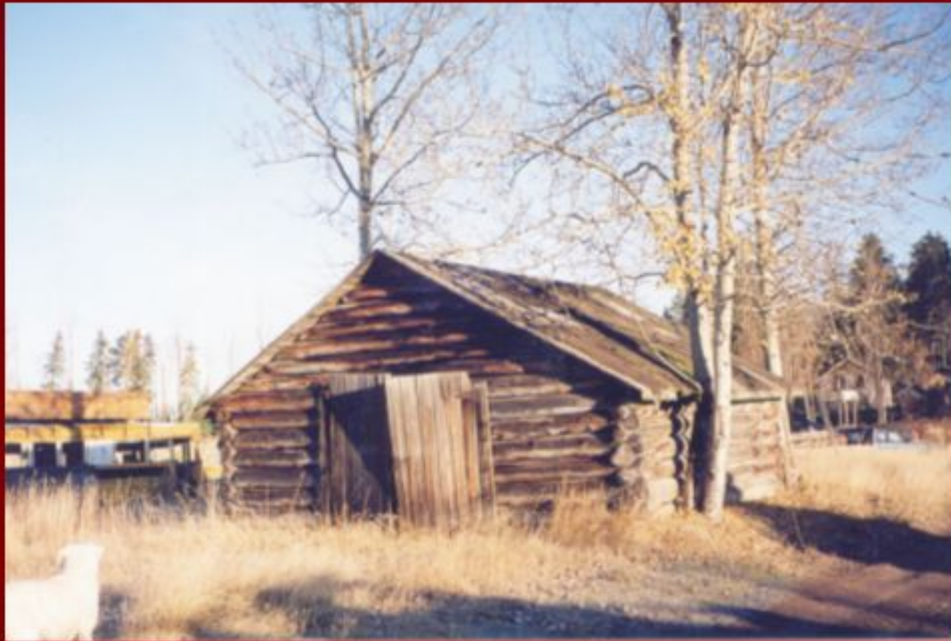
The blacksmith shop on the Blackburn (now Goodkey) farm