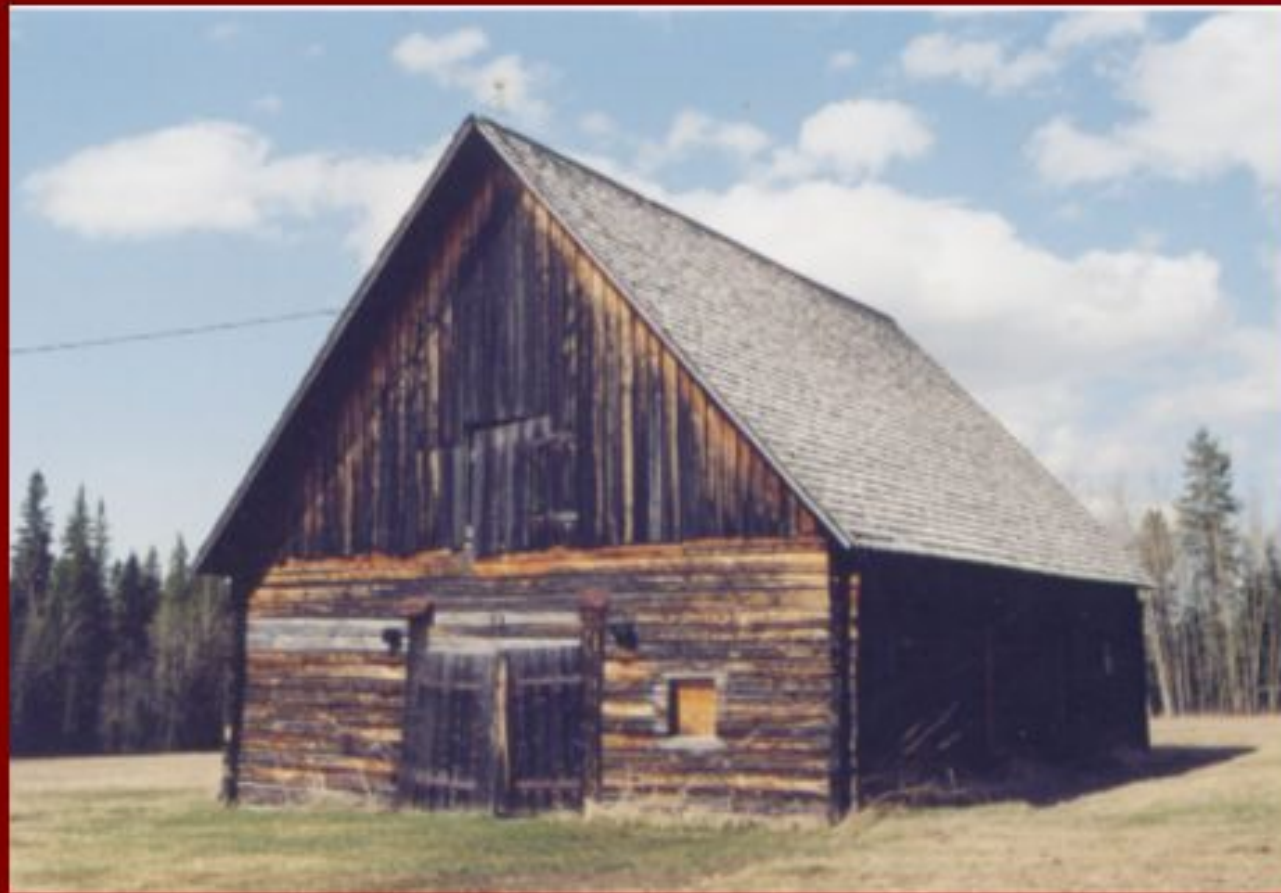
Barn on Pedscalny Road built by Walter Shuren