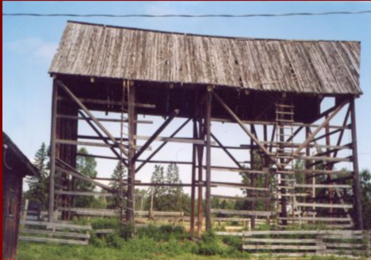
Crooks and Junkers hay-shed (now collapsed)