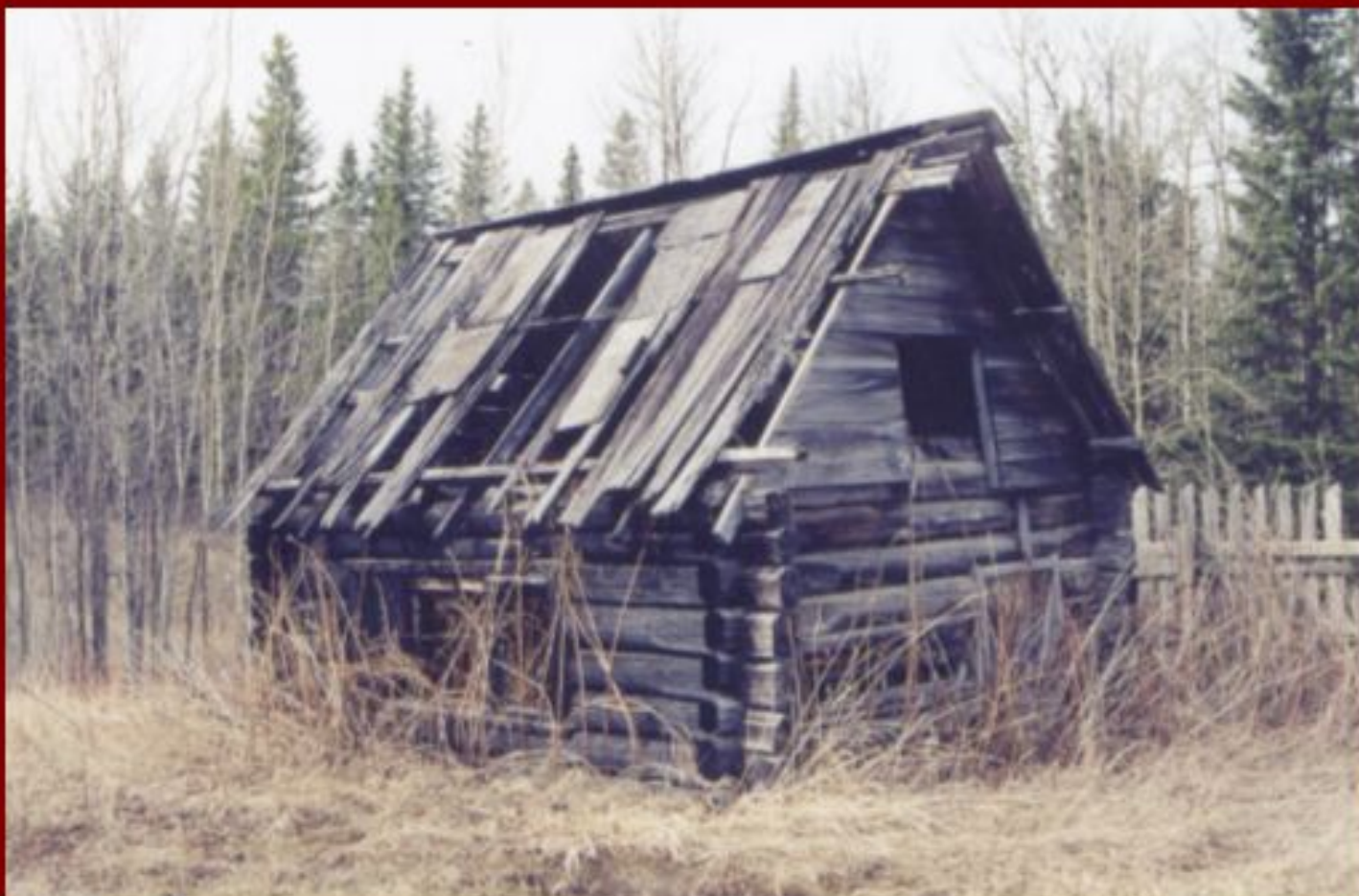
Michalchyshyn's ice house on Pedscalny Road