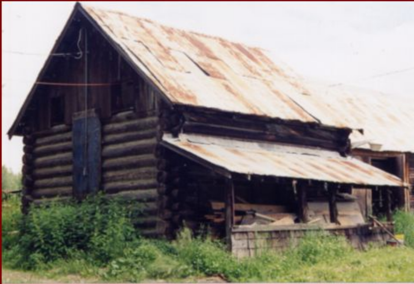
Scotty Howsin's old house on farm