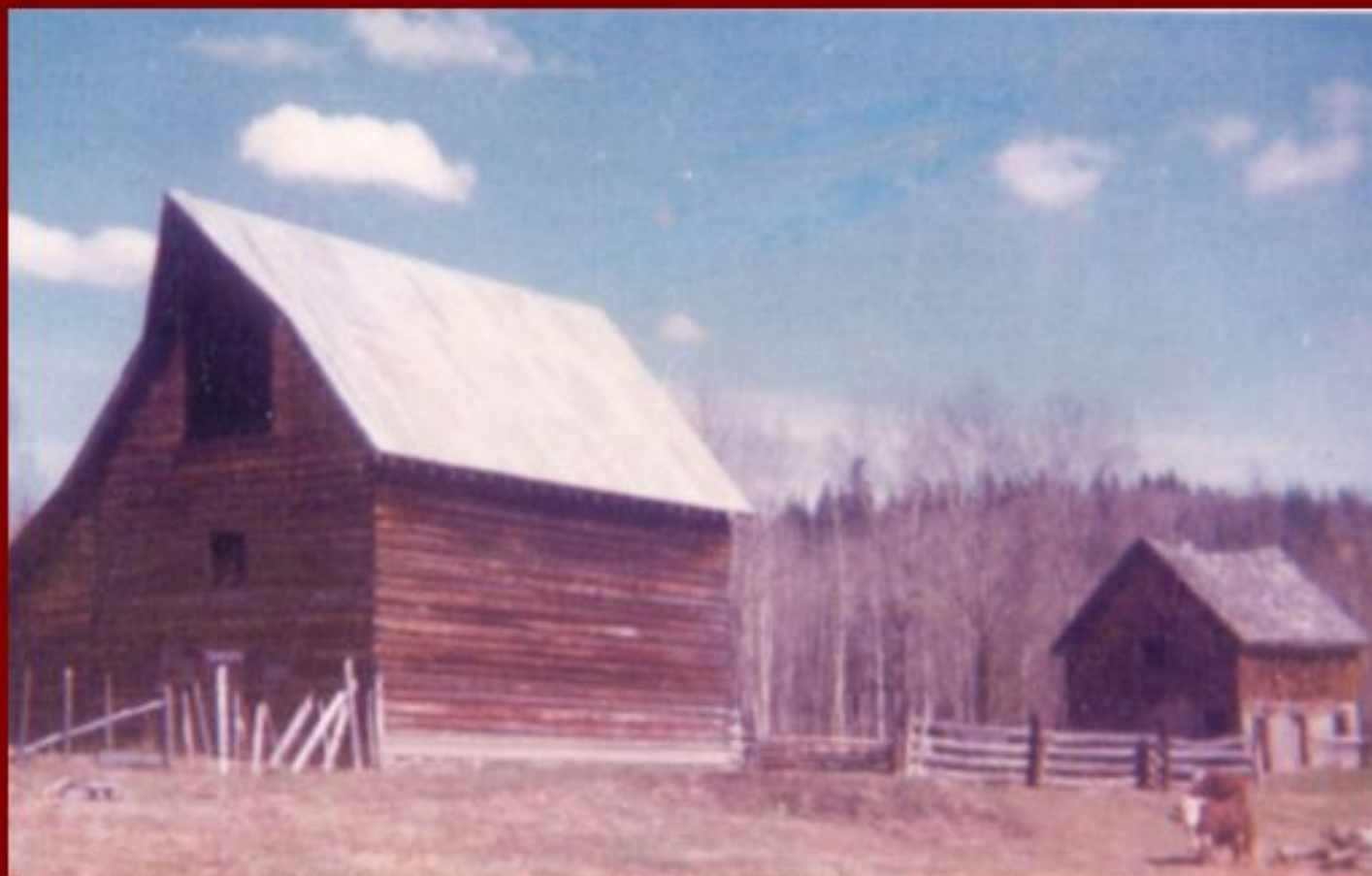
Denicola barn that was burned