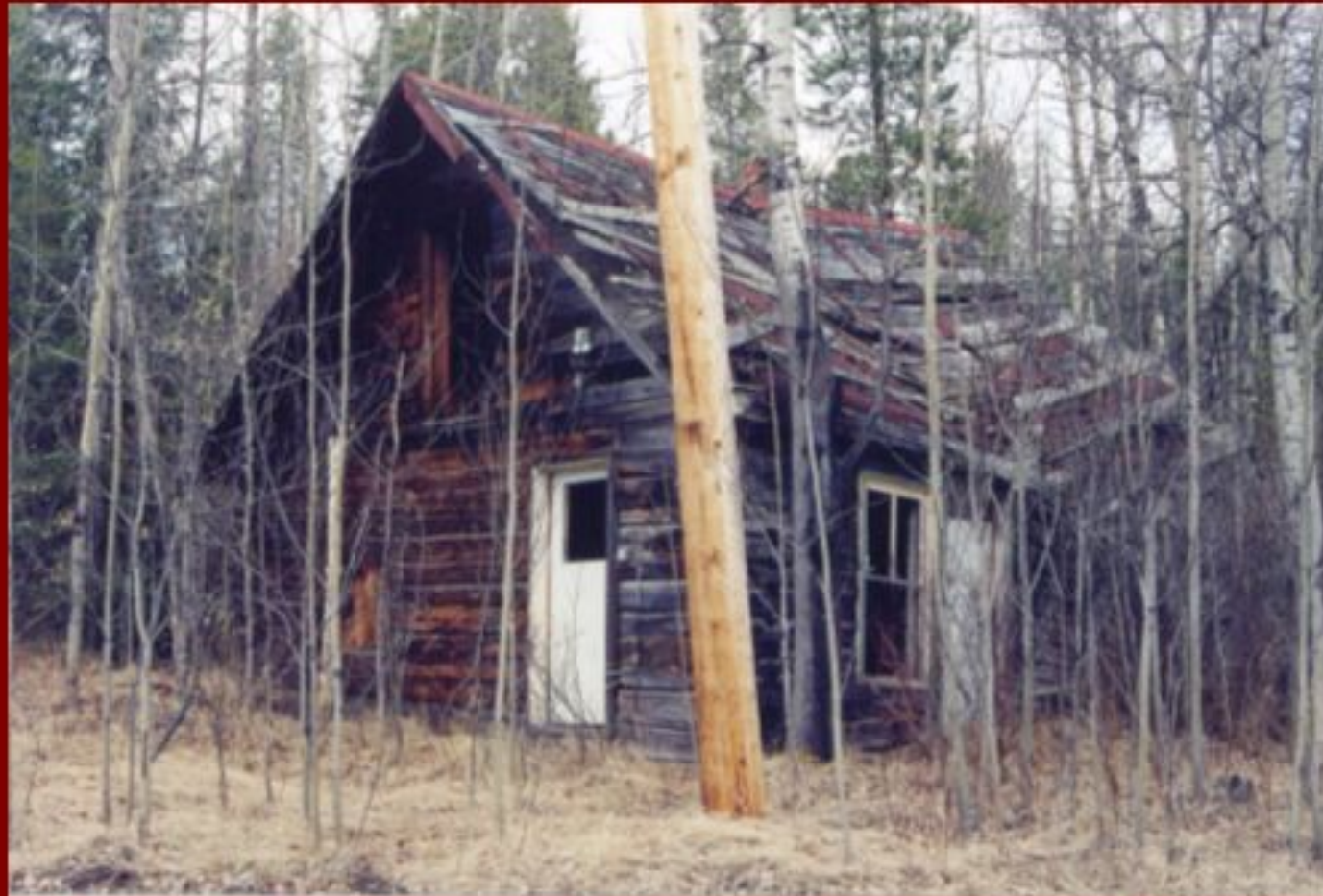
The Sowpal's first homestead house on the corner of Evasko and Havilland Roads