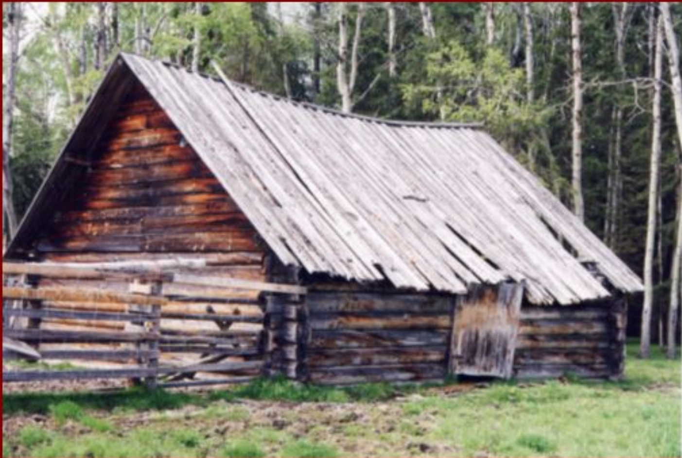
Big barn built by Rudolf Kwiatkowski