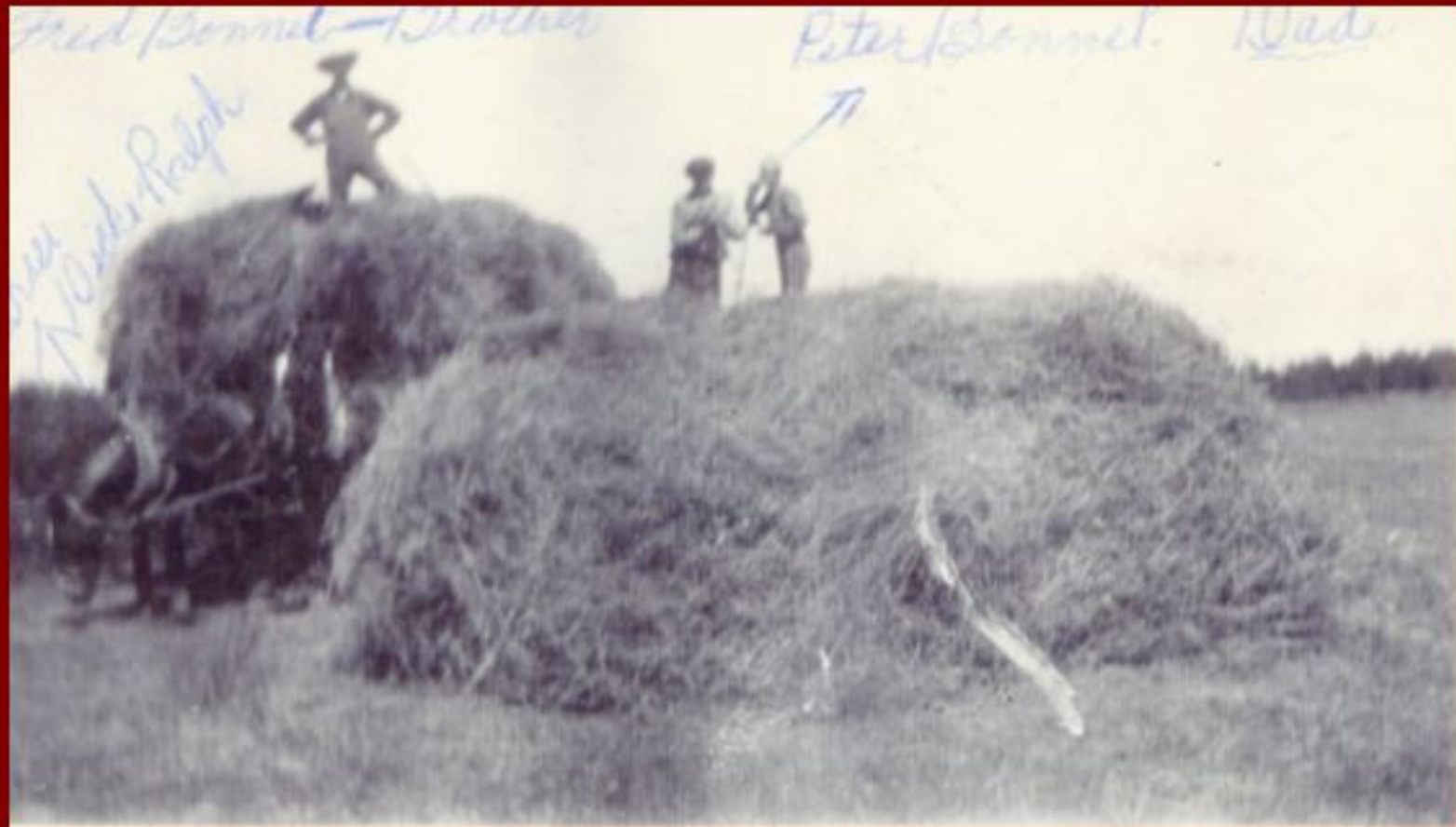
The Schlitts making hay