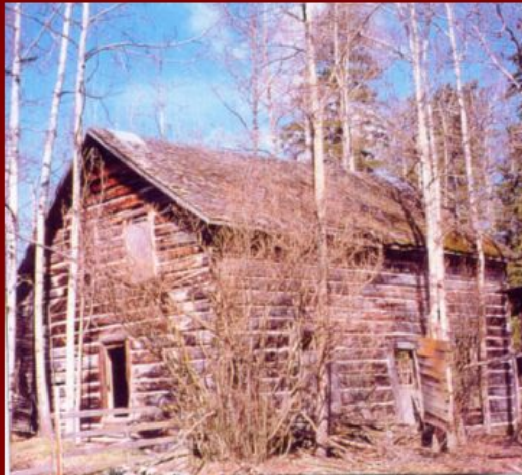
The Robert Blackburn house before restoration