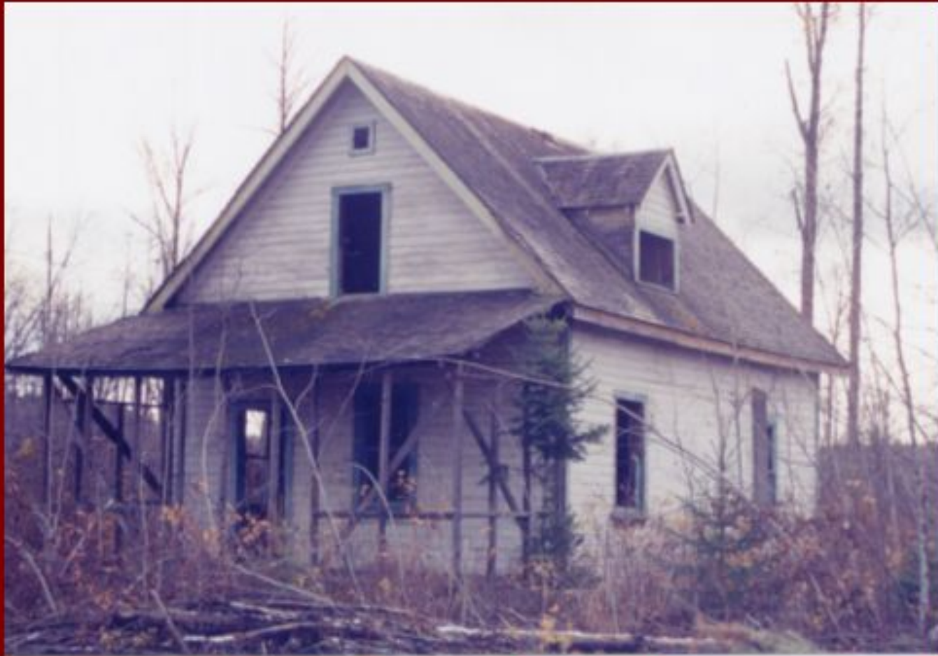
Pankew's whip-sawn timber house