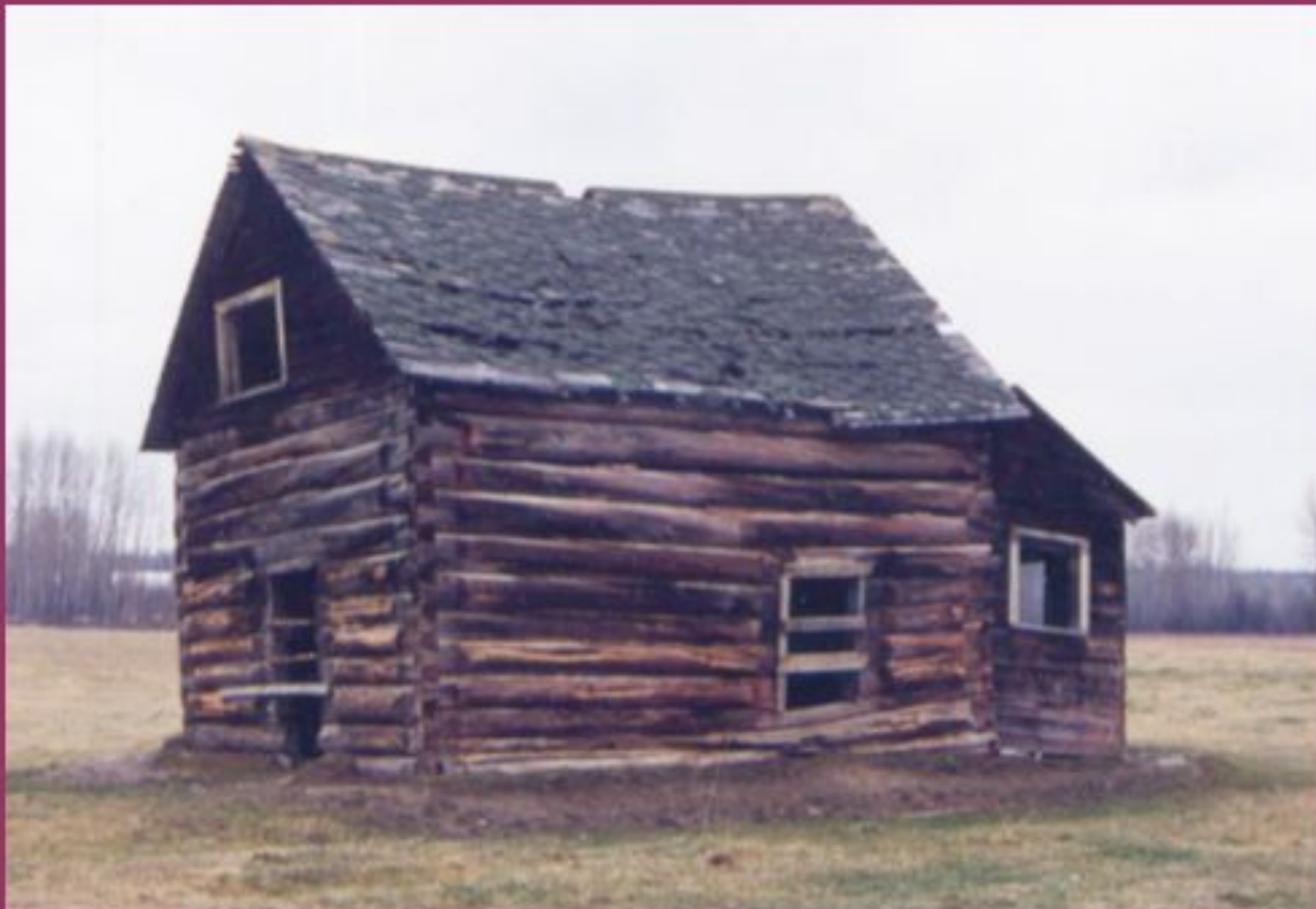
The Campbell house at the end of the Salmon Valley Road