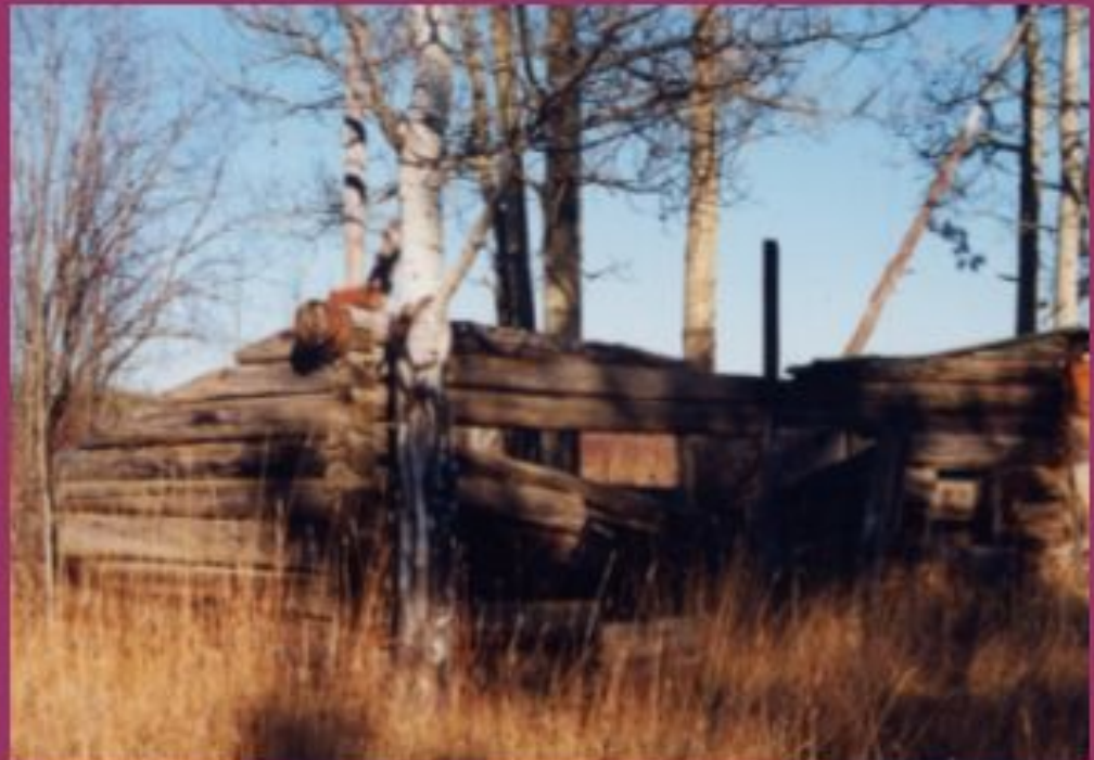
Remains of Smaaslet barn