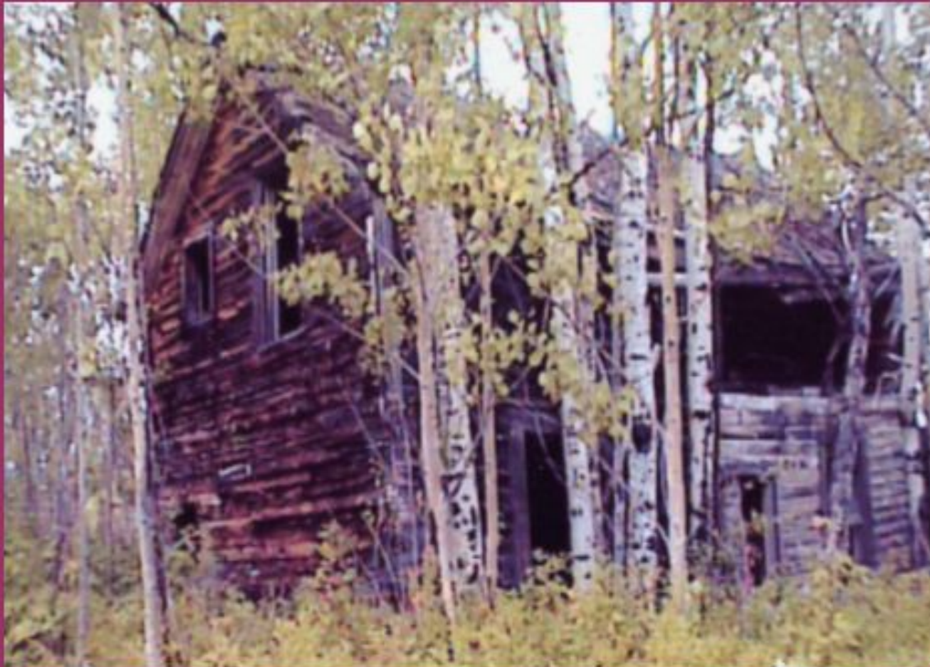
The Turner house today