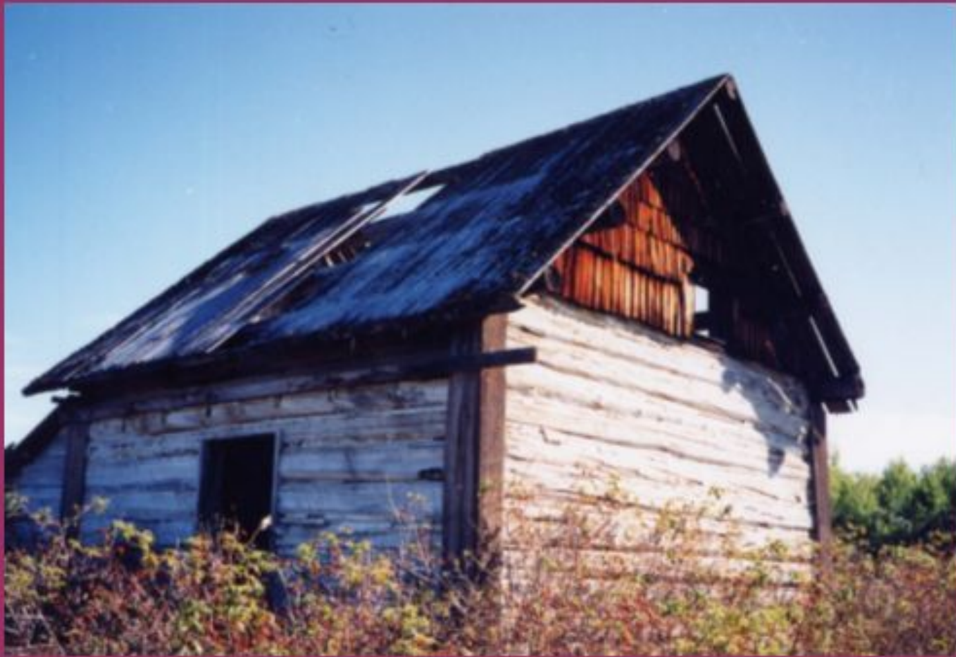
The Towler house