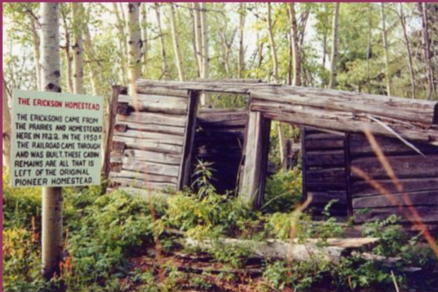
One of the two cabins left on the Edward K. Erickson homestead