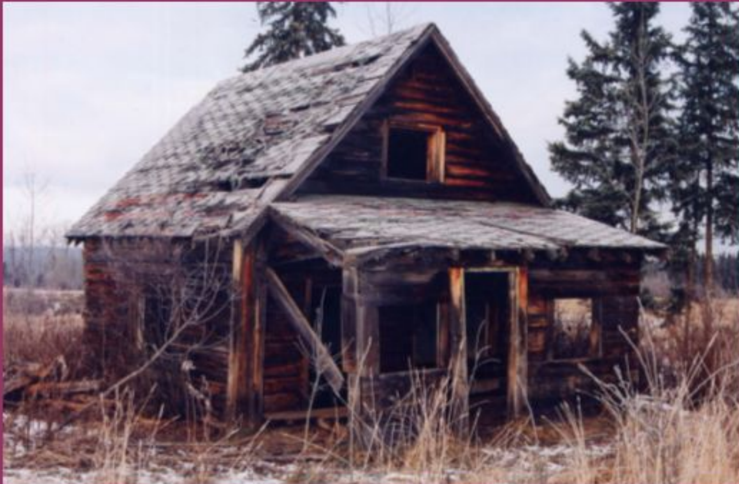
The Shield's first log home