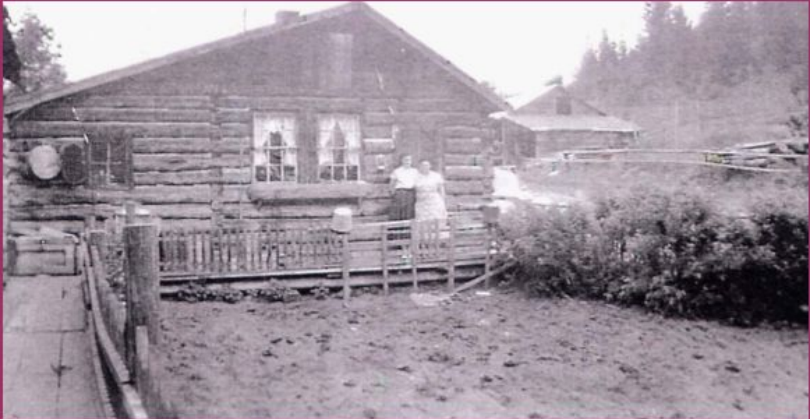
The Ericksons house on the Golden Rule Poultry farm