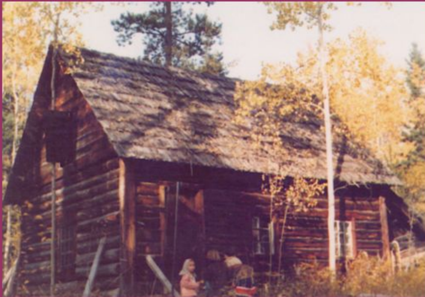
The Persson homestead house, now torn down