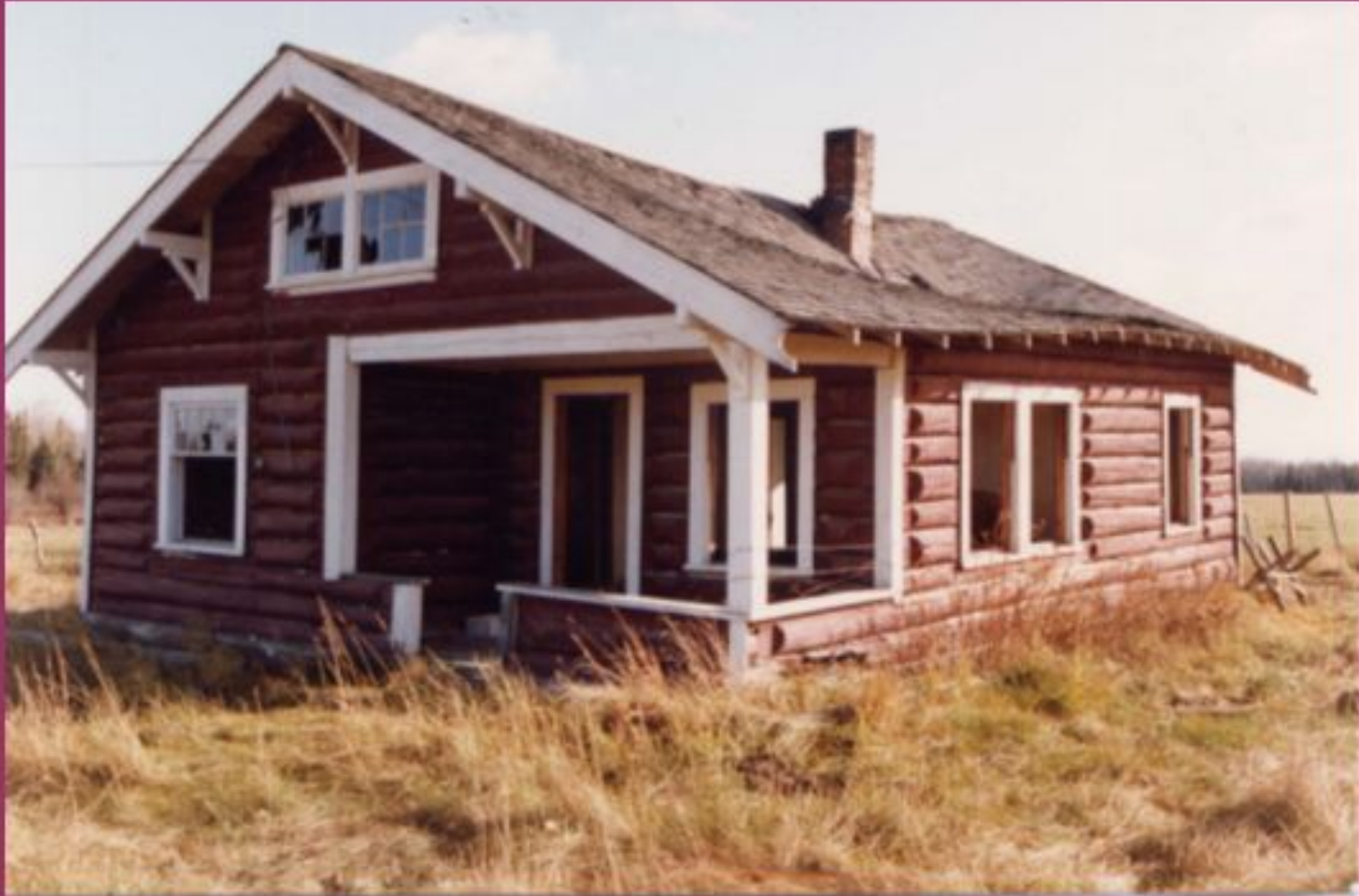
MacNeill's house which contained a post office