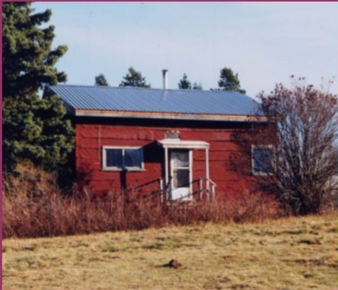
The Ruste house, greatly changed from early years