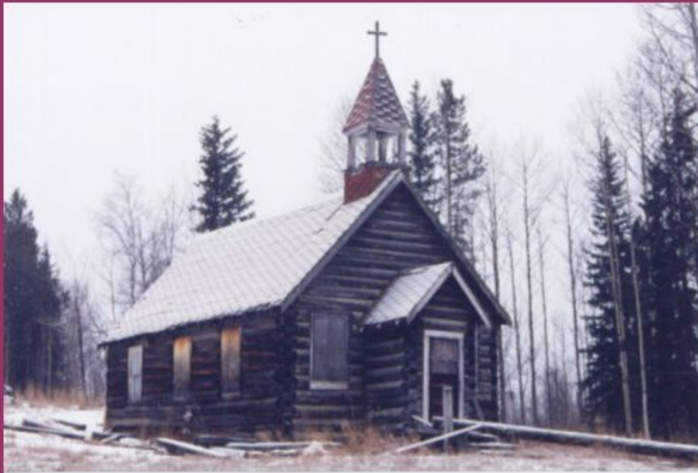
The St. Lawrence Catholic Church at Salmon Valley