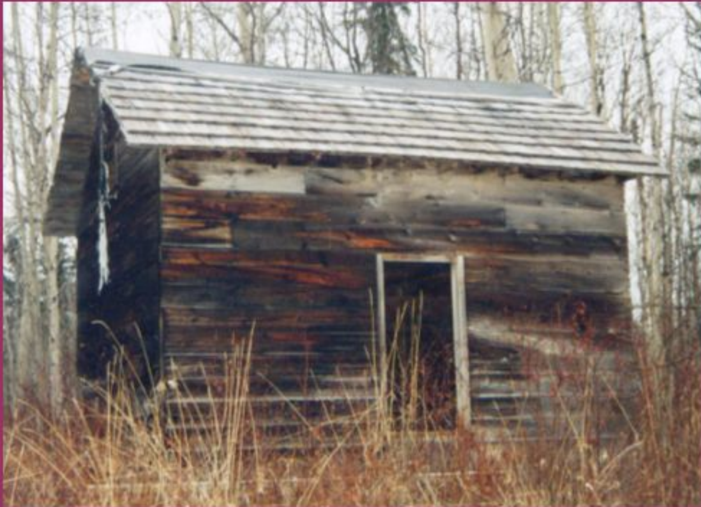
The Gilbertson cabin