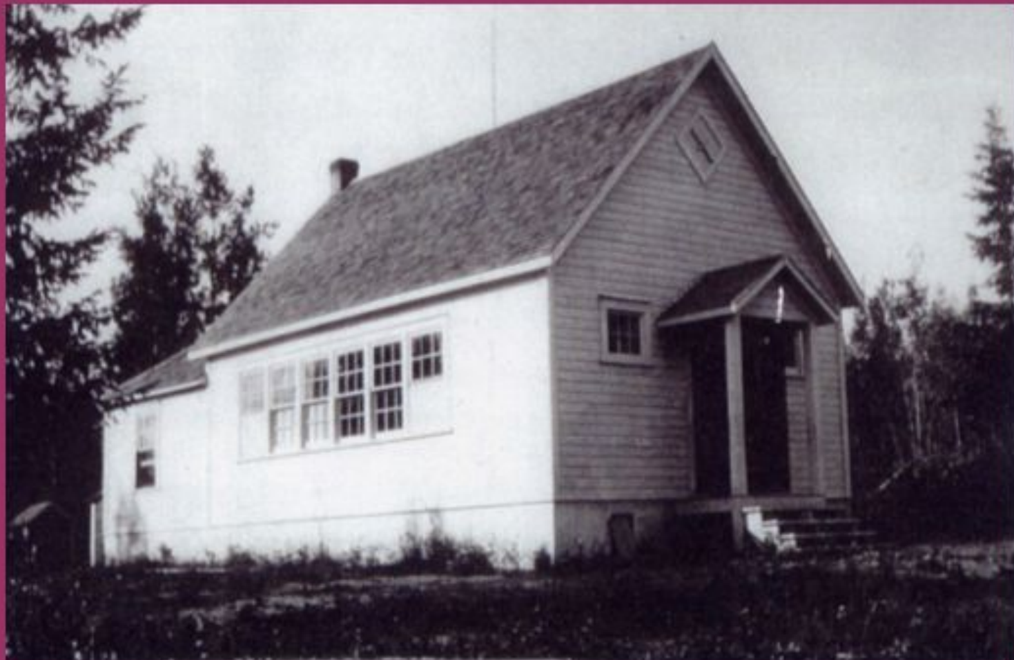
The Salmon River School by the Ruste farm, before it was moved