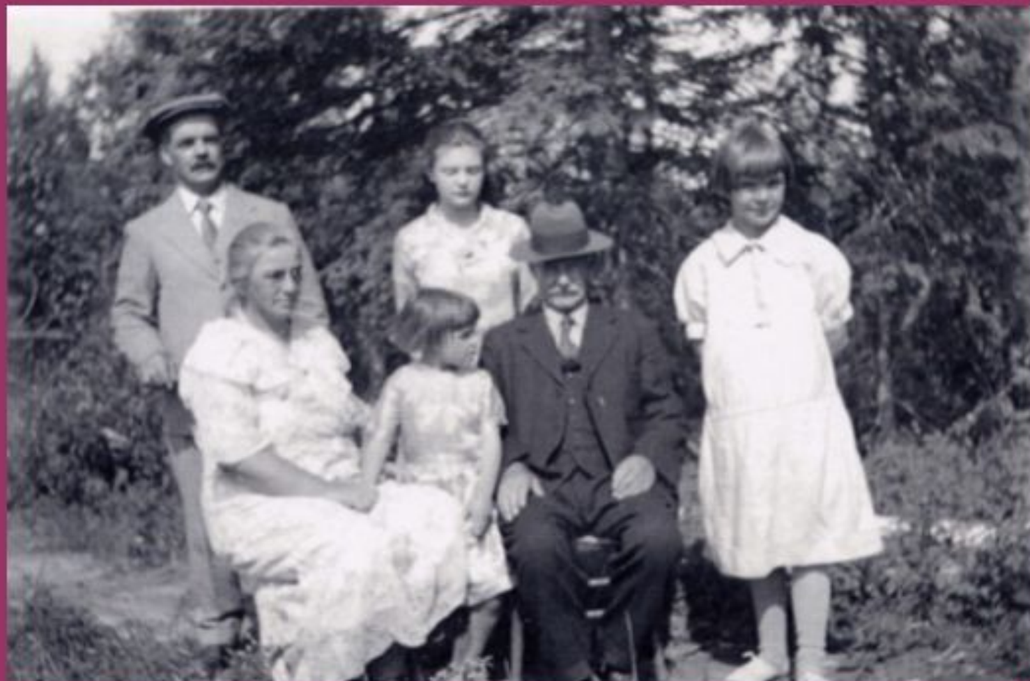
The Bowyer family