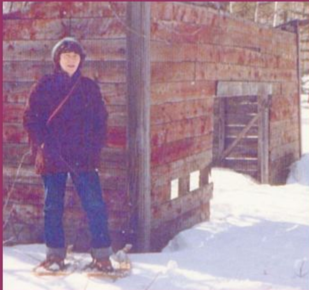
Old woodshed or horse shed where the Salmon River School once stood. Author is standing by shed.