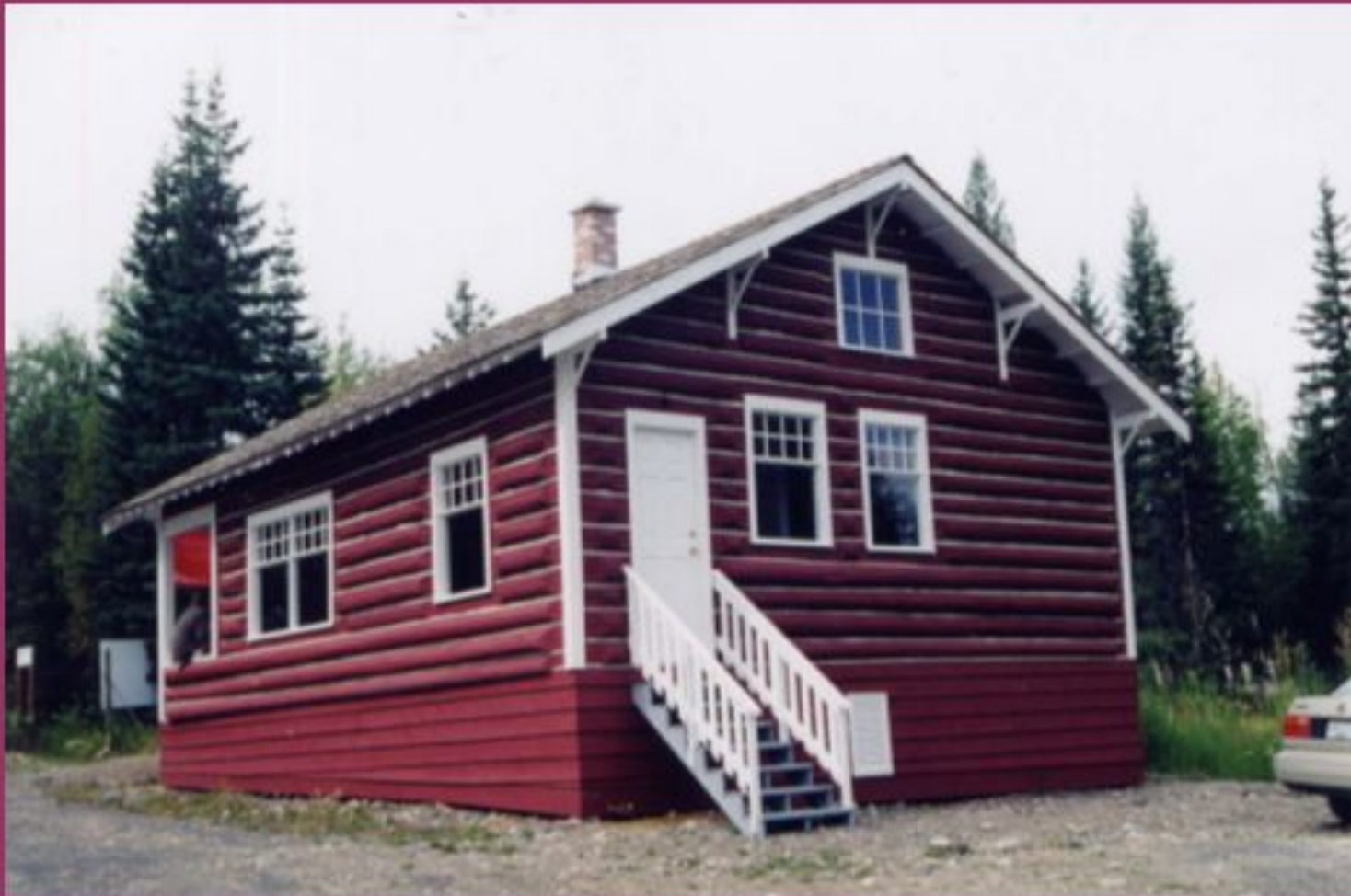
The restored post office