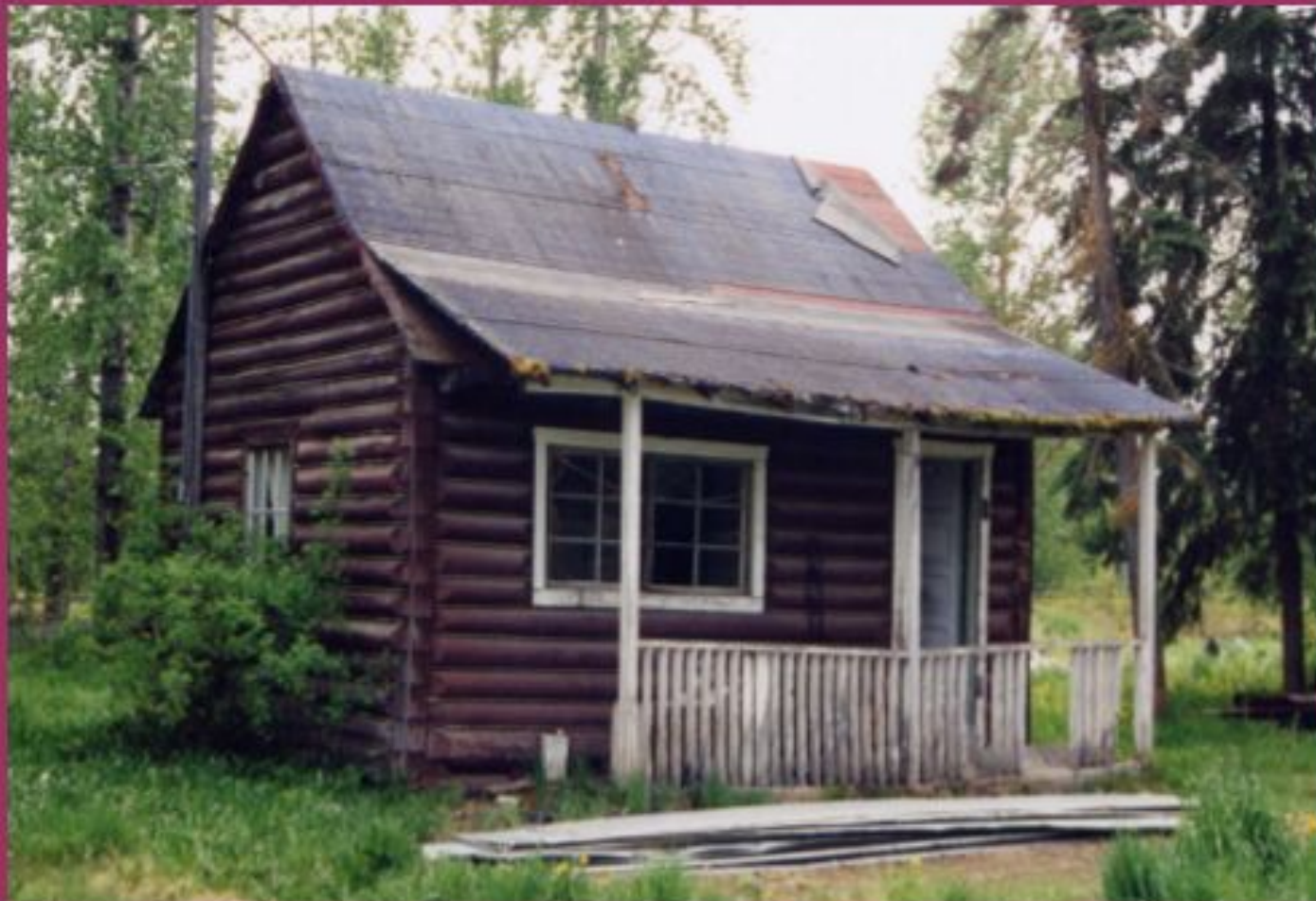
The DeGrasse house in Salmon Valley