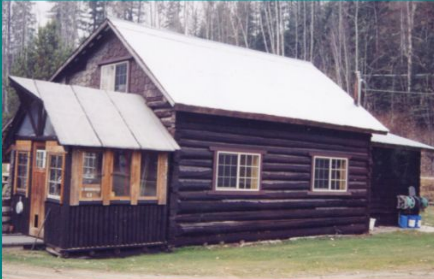
Doc Nichols house, now Woodward's