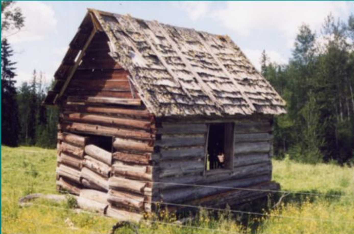
A shed, the only log building left at the Grundahls