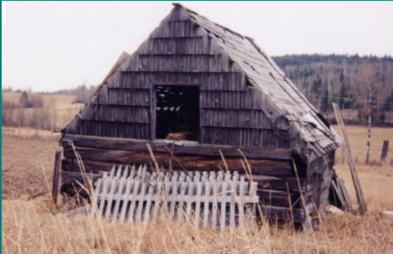
Small barn built by Sidney Falkus