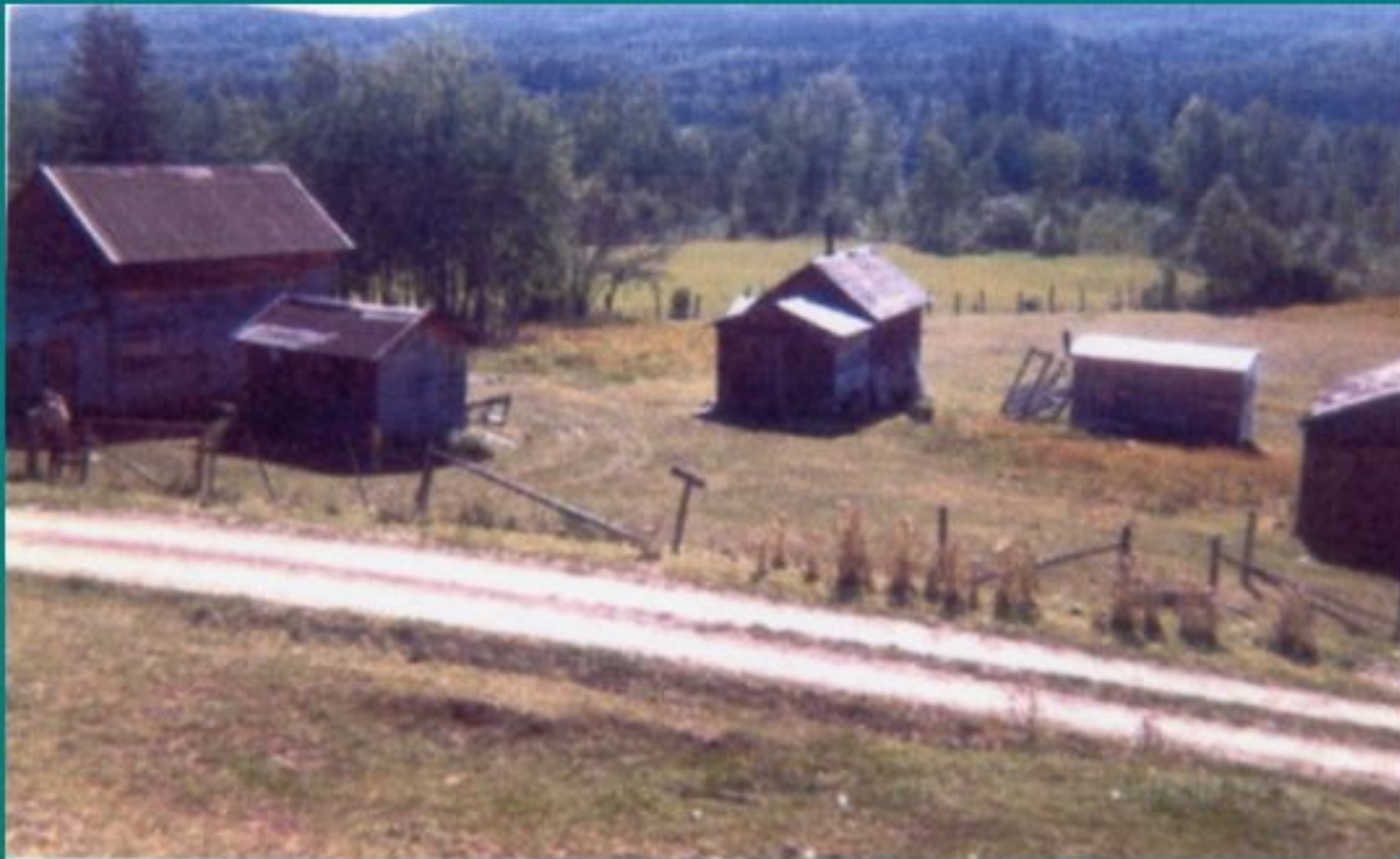
The Semerad homestead