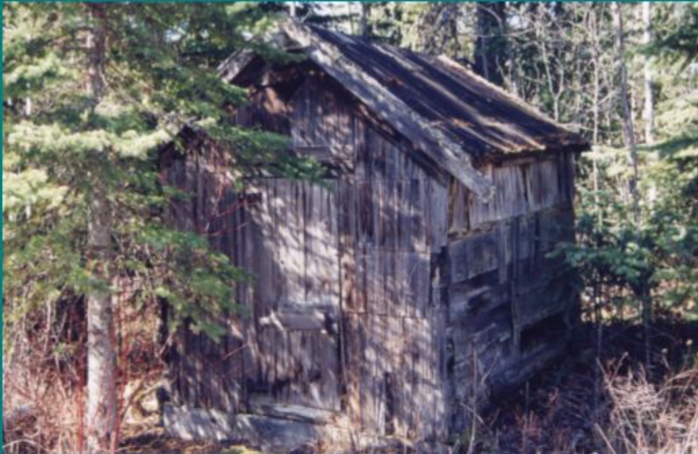
Johnson's meat shed