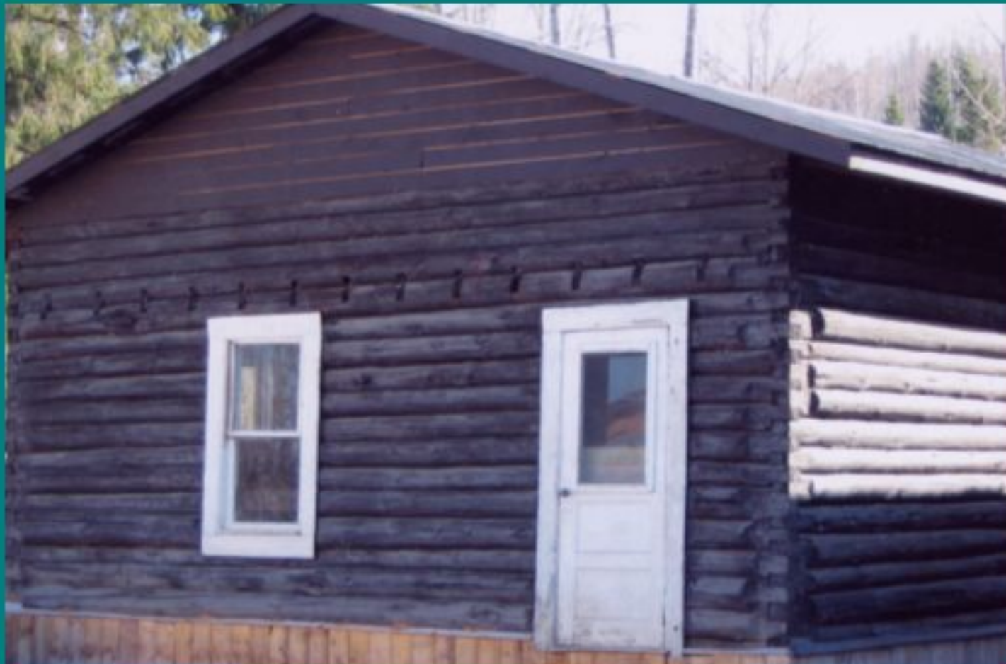
Restored Coulter house in Hixon, used as an antique building by the Meads