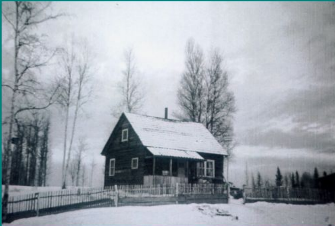
The Monnich house