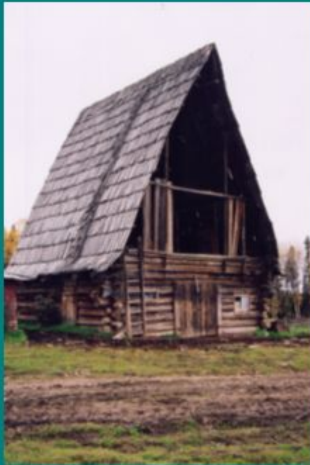
Lazaroff barn with very high roof