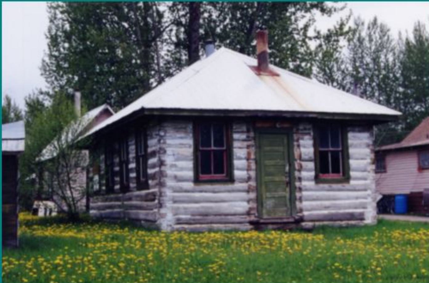
Old Canyon Creek School in town of Hixon