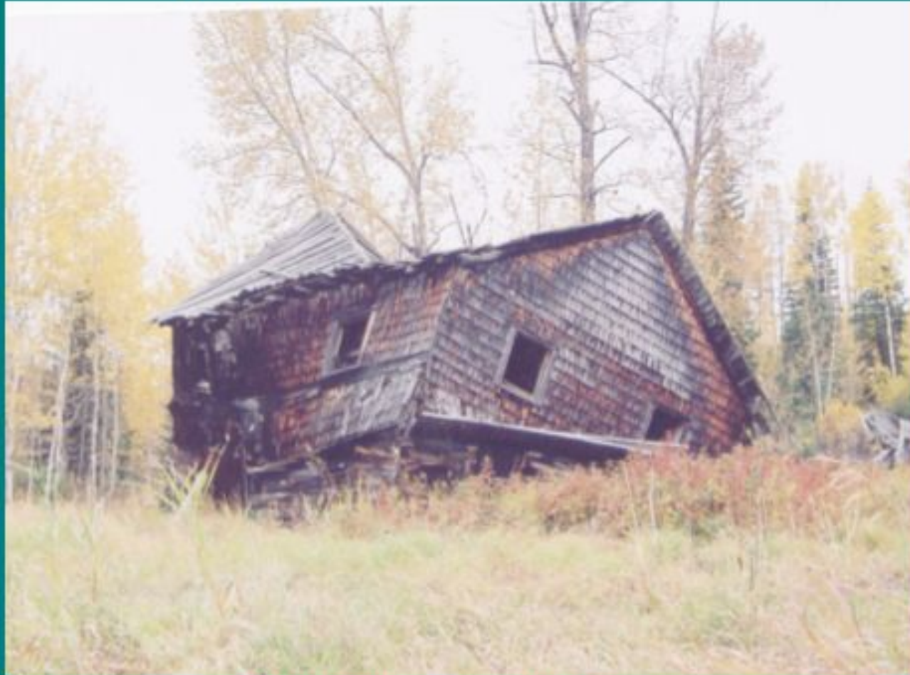
MacKay's second log house