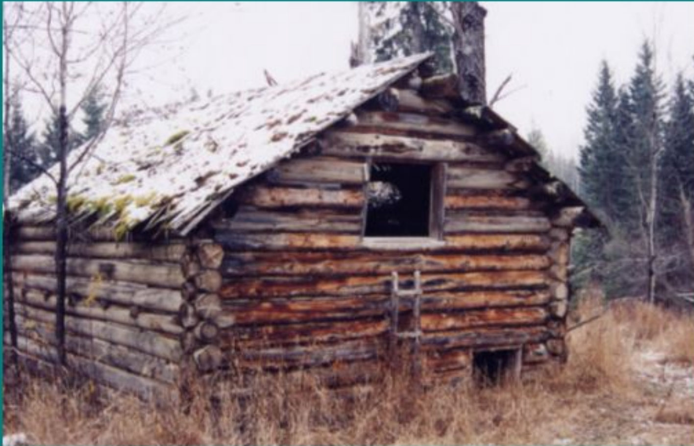
Krans cabin by creek