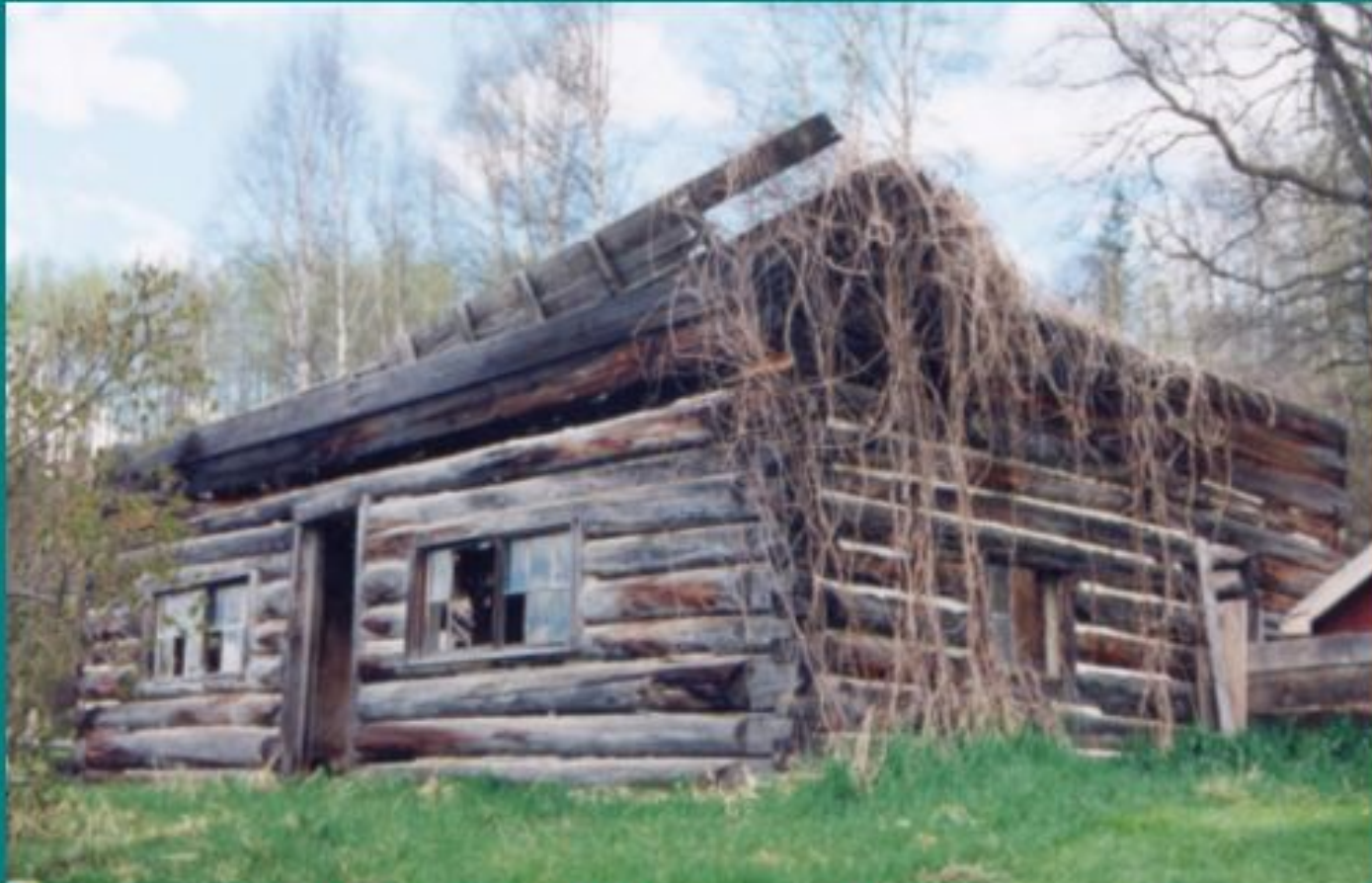
Gale Colebank's house with roof caved in