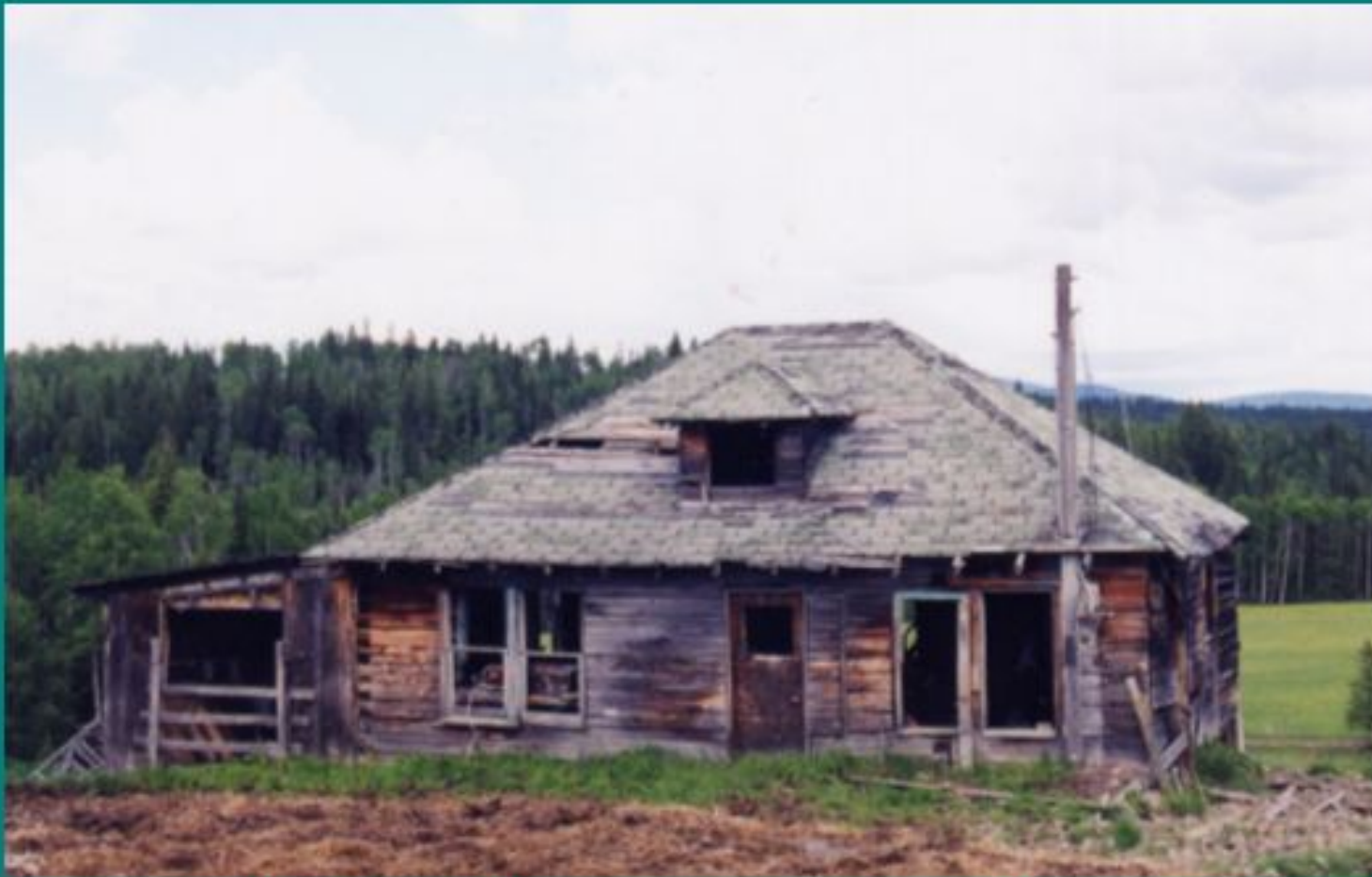
Engliking's house now used as a barn