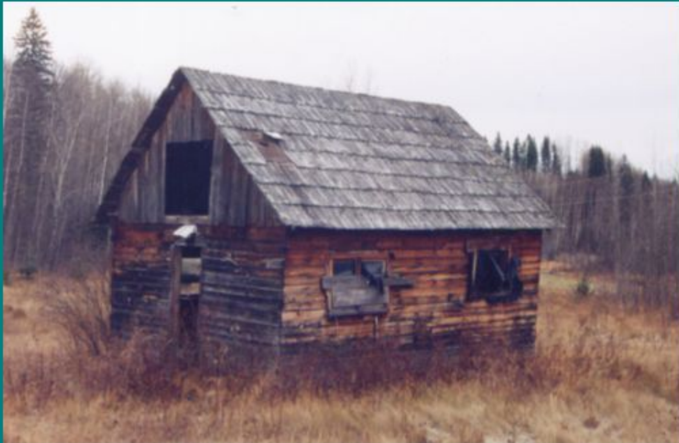
Little board house built by Penski on Thorley Road