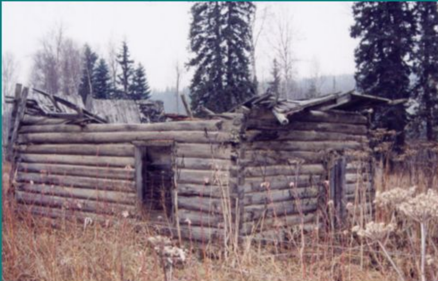
Glen Colebank's house on Swanson Road with the roof caved in