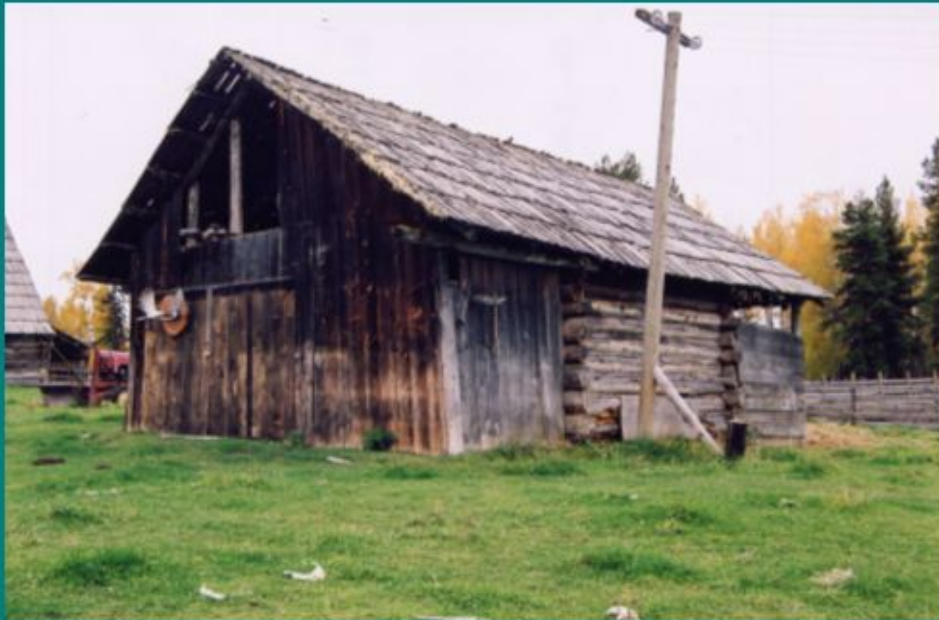
Lazaroff blacksmith shop