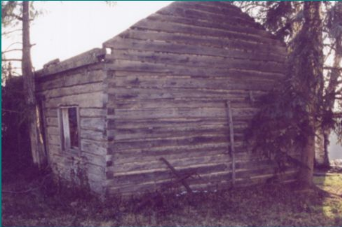
Remains of first log house built by Charlie Sahlstrand