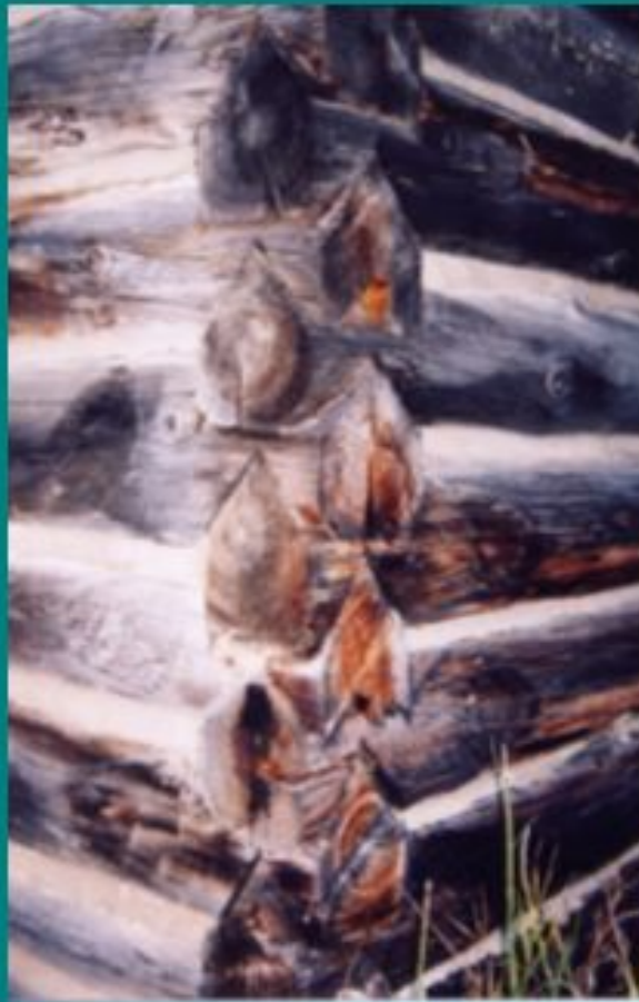
Diamond-shaped log detail of Lavoie house