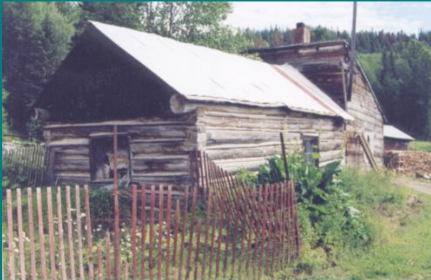
Trapper Reid's cabin off Lake Road