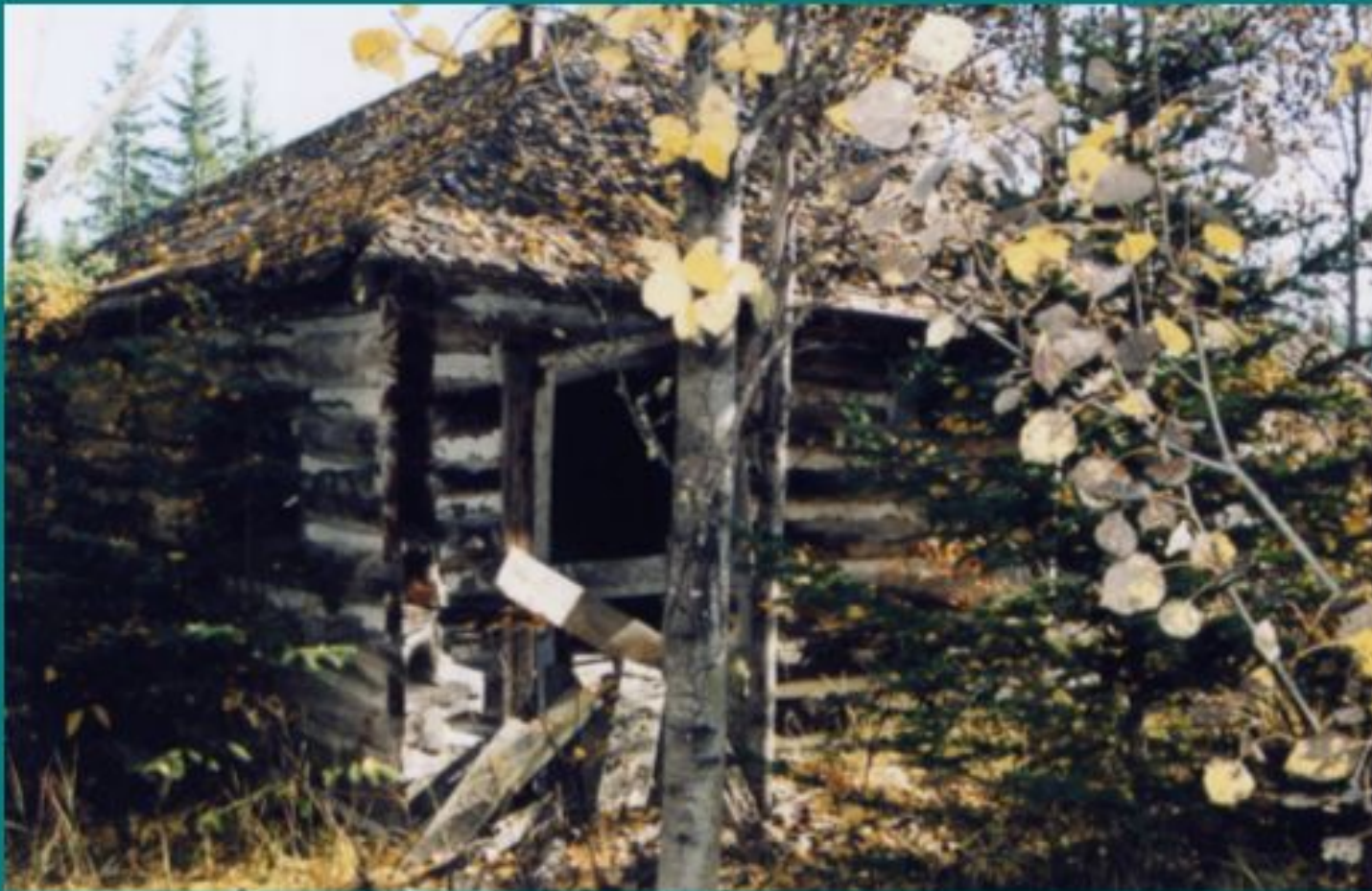
The other house on Hannakan property