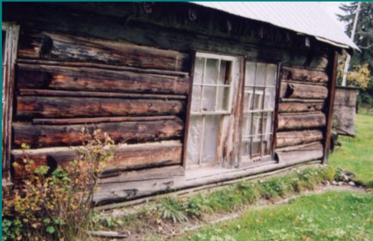
Window and log detail of Thorley house