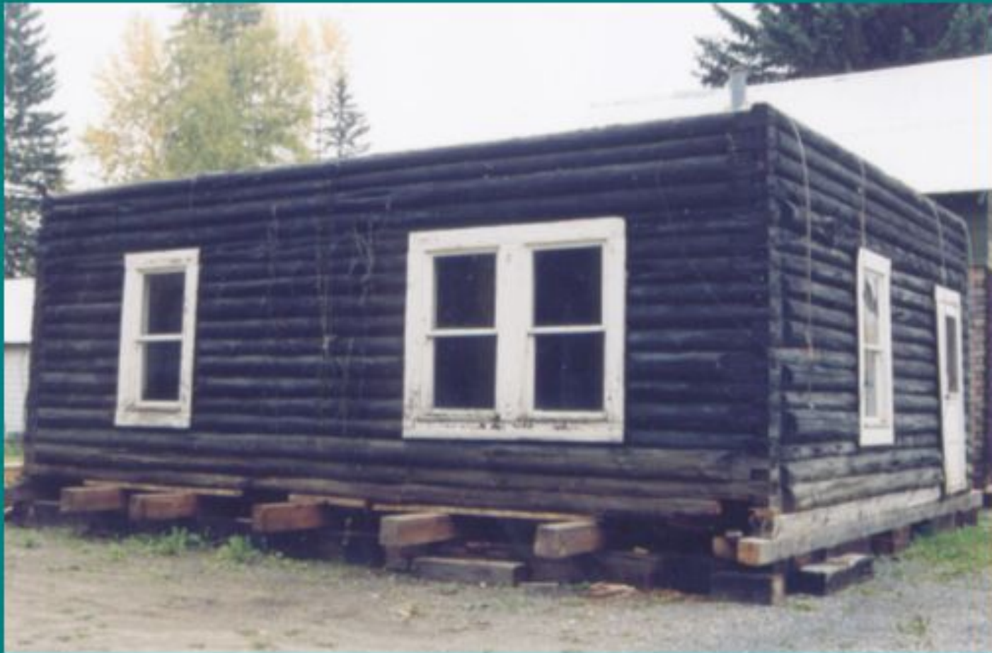
Walls of the Coulter-Larsen house