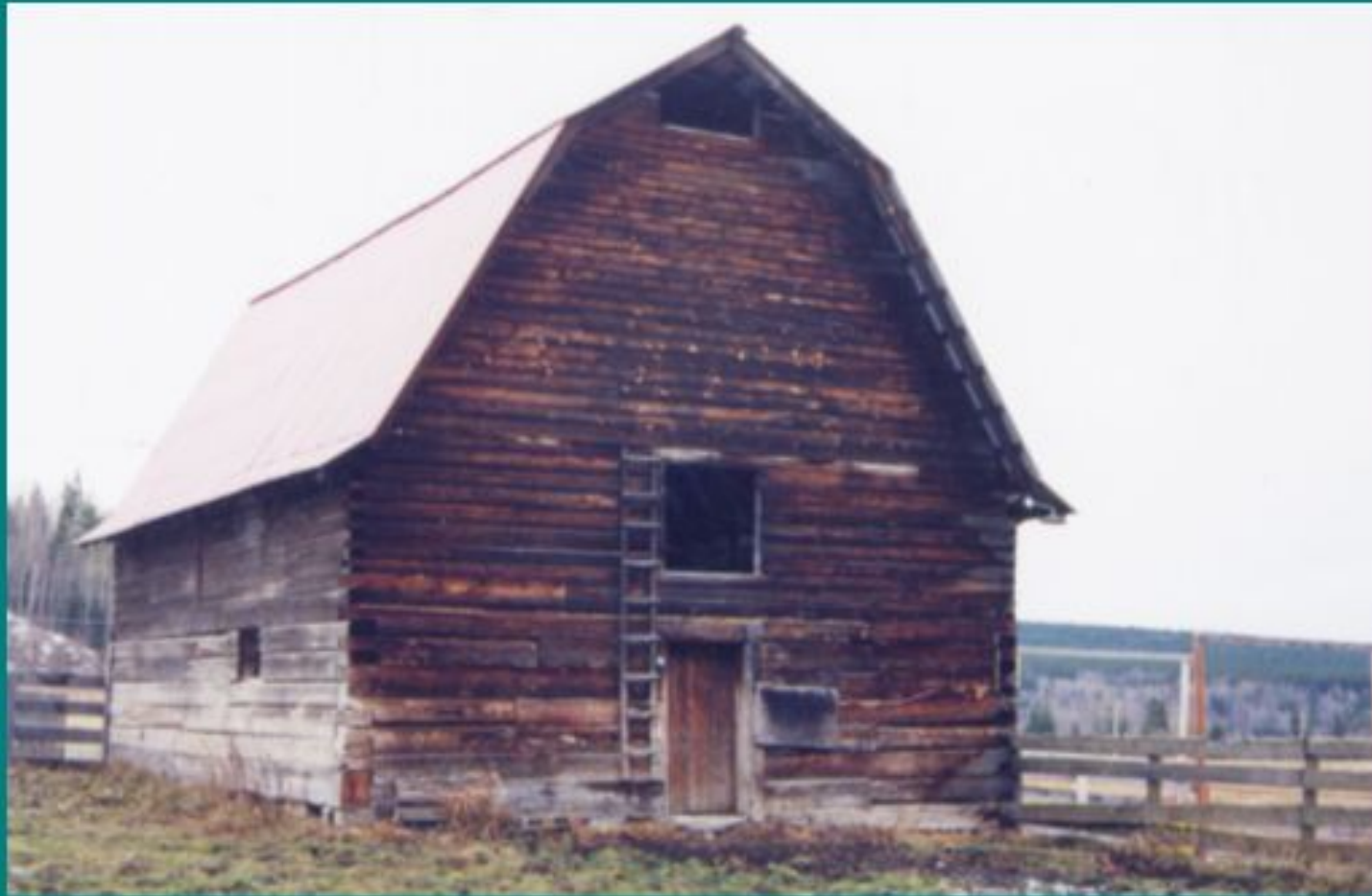
Matt Anderson's barn built in 1916