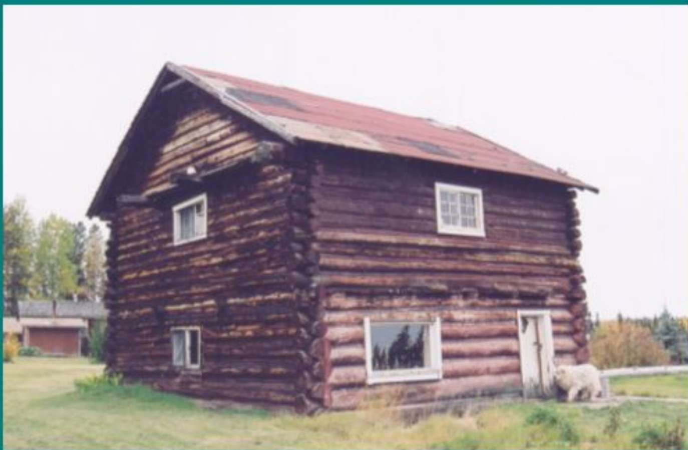
Lazaroff house on Lavoie Road