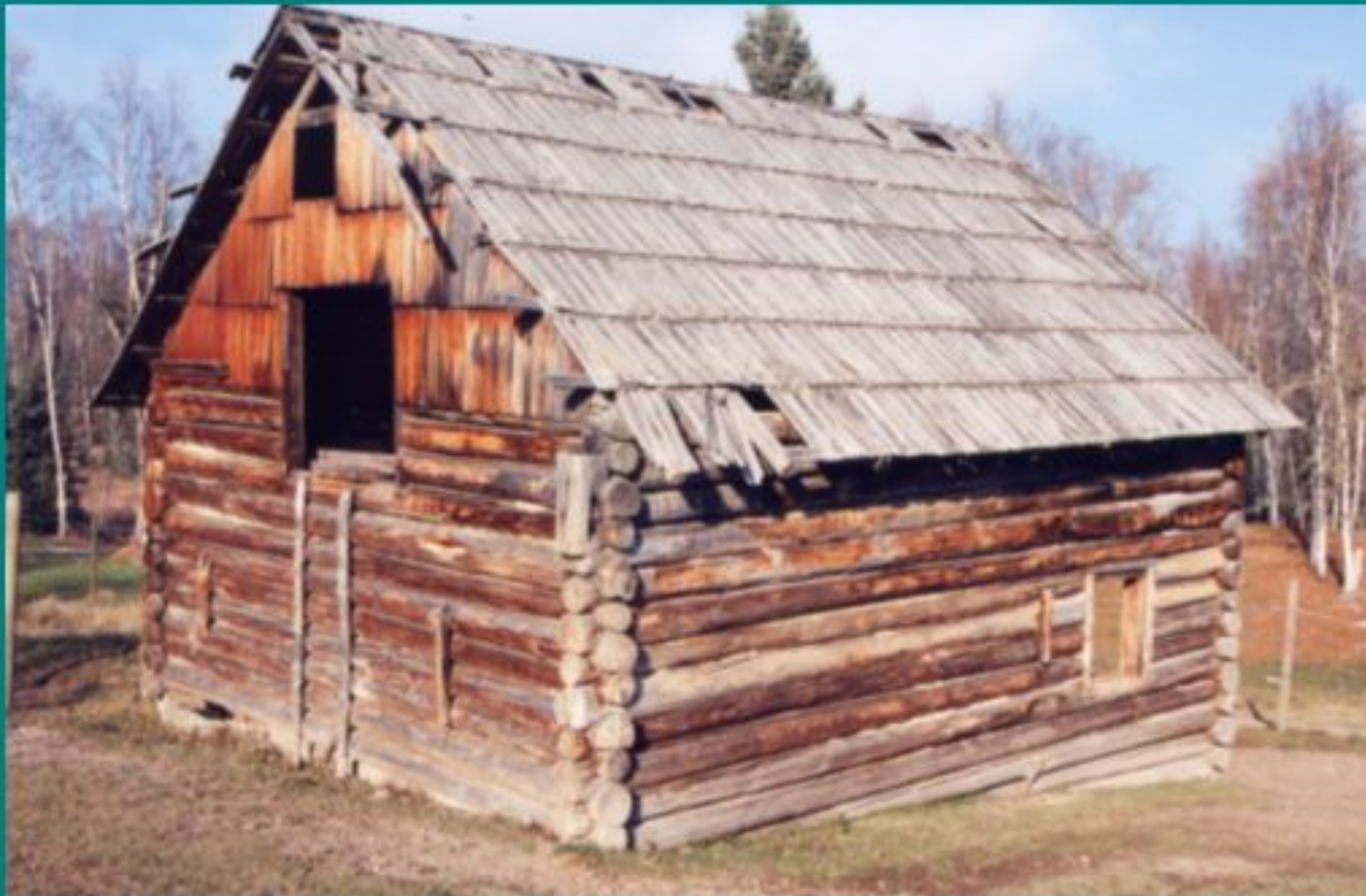
Small barn built by Sahlstrand