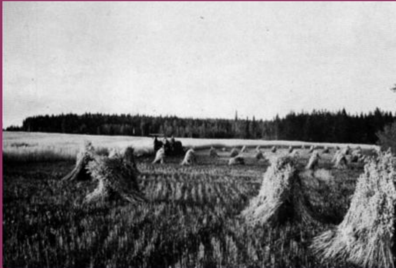
Cutting grain with a binder and making stooks