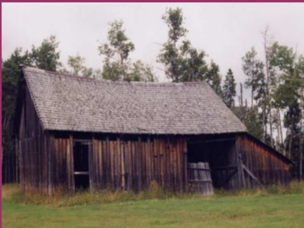
Gustave Hiller's hay shed