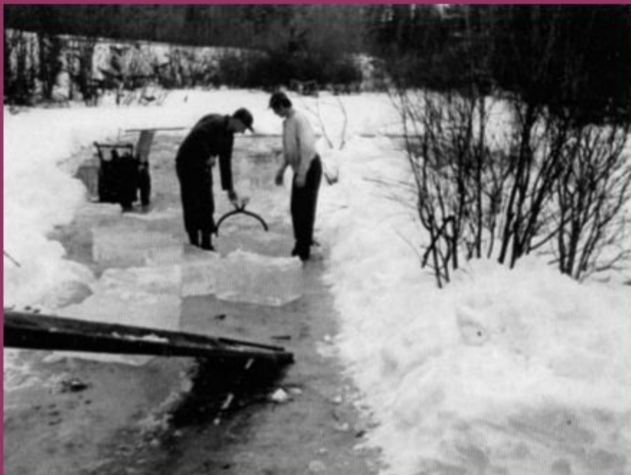
Cutting ice from the creek for the ice house on the Kienzle farm