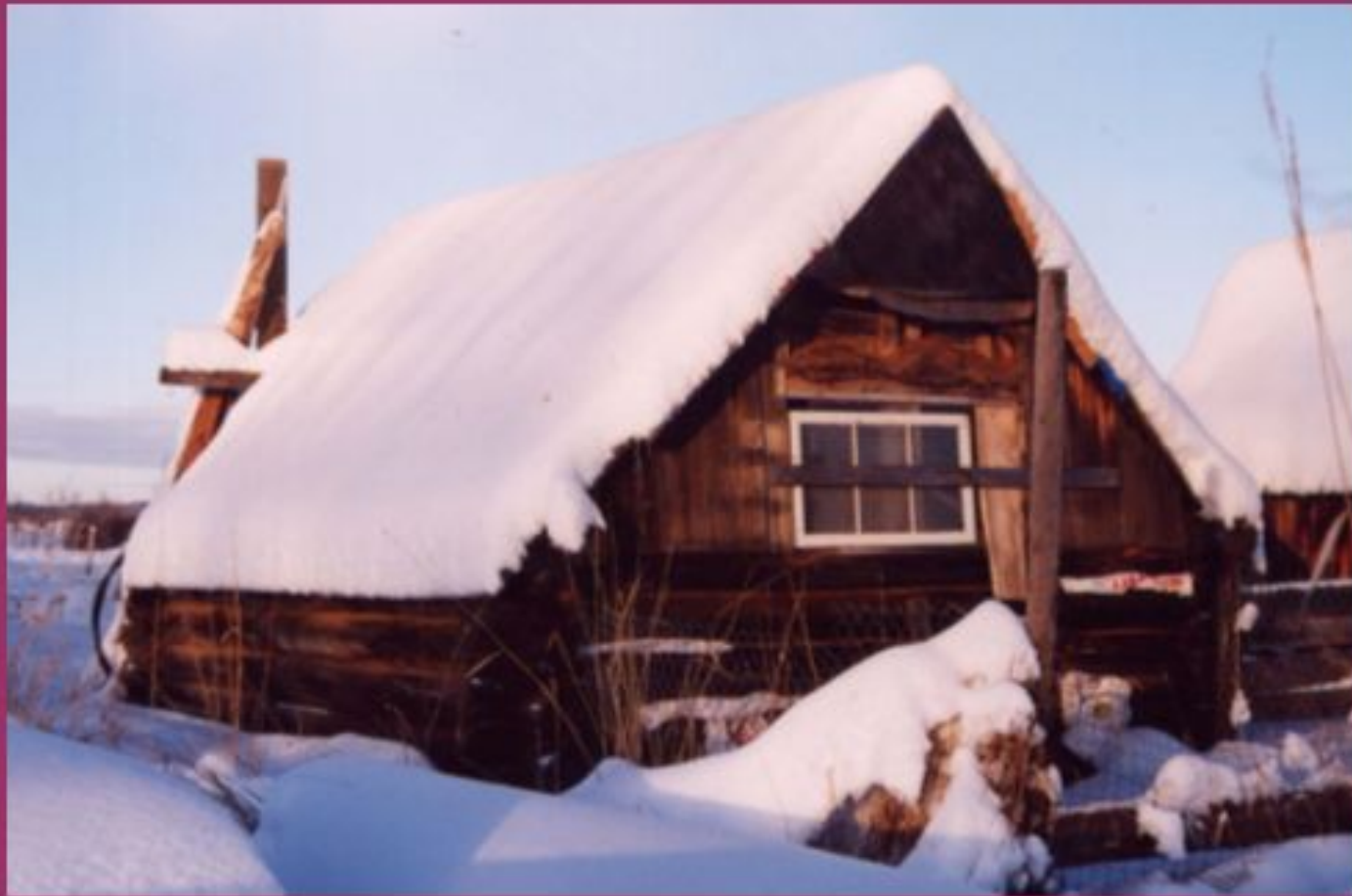
This building used to be the ice house on the Kienzle farm