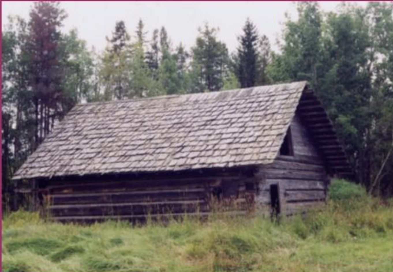
Gustave Hiller's pig barn