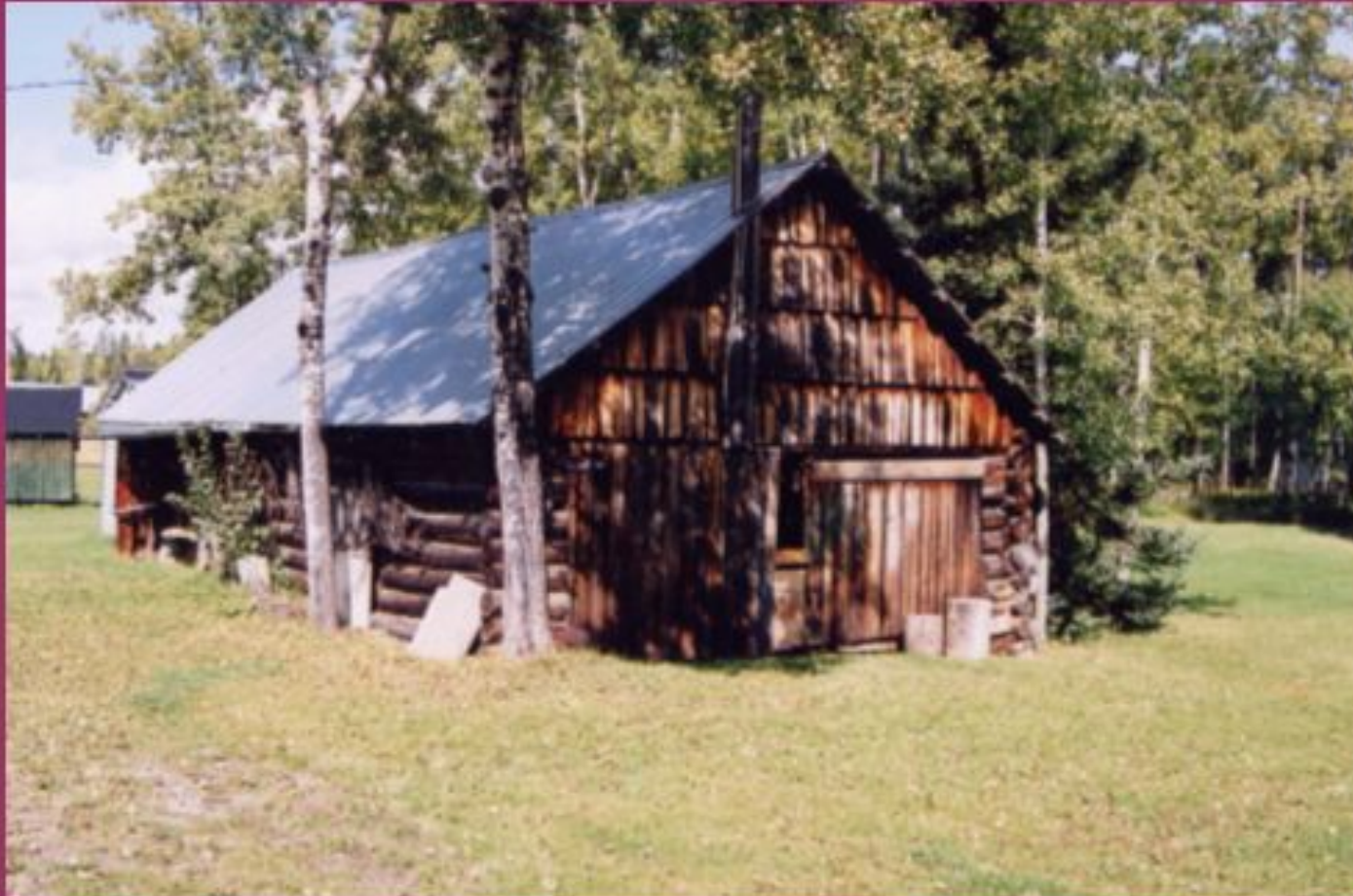
Henderson tractor and car shed