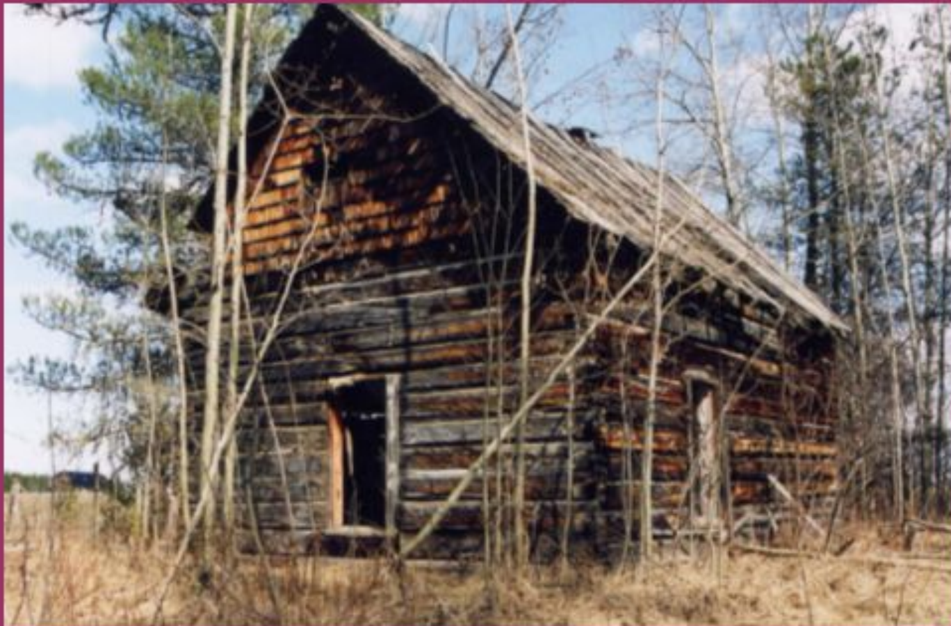
The house that was built by Gessicus