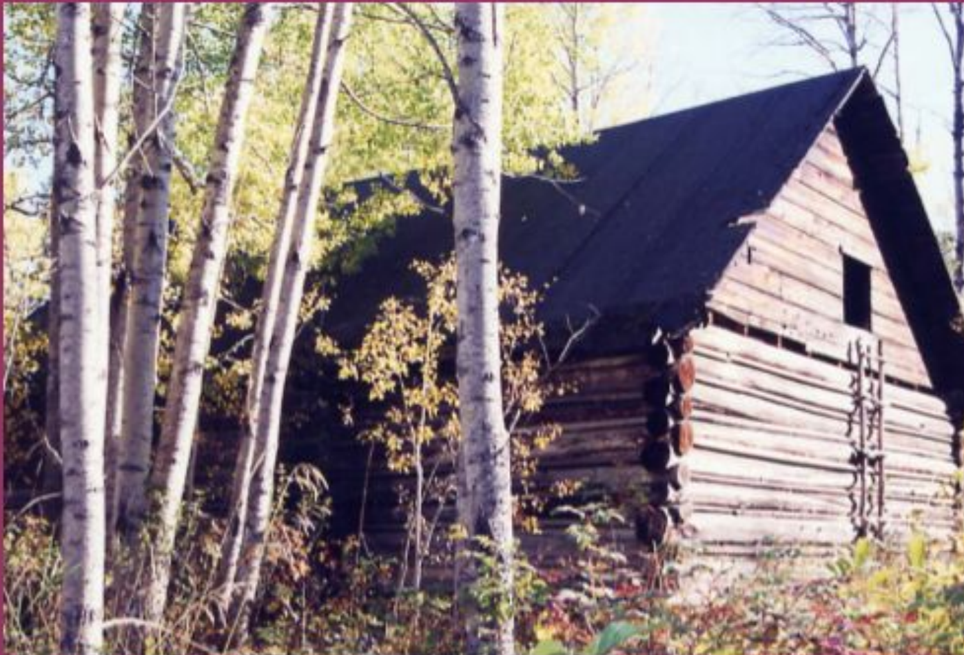
Remains of Beaverley School built in 1918