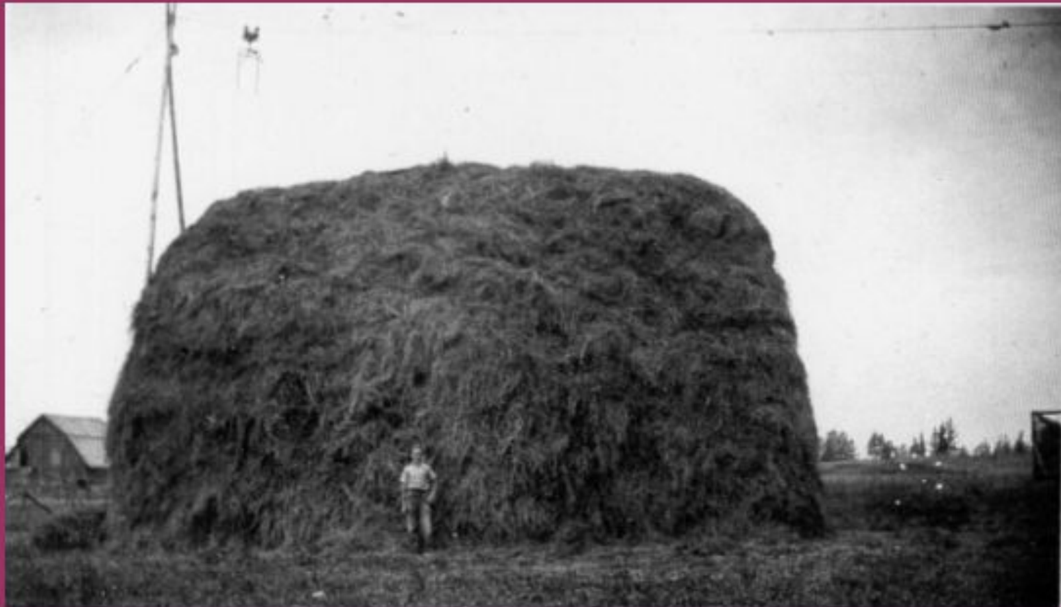
A large outdoor haystack made by using a hay fork, on the Kienzle farm