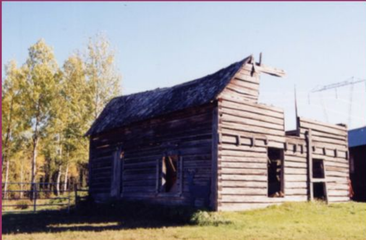
Remains of the Muralt house