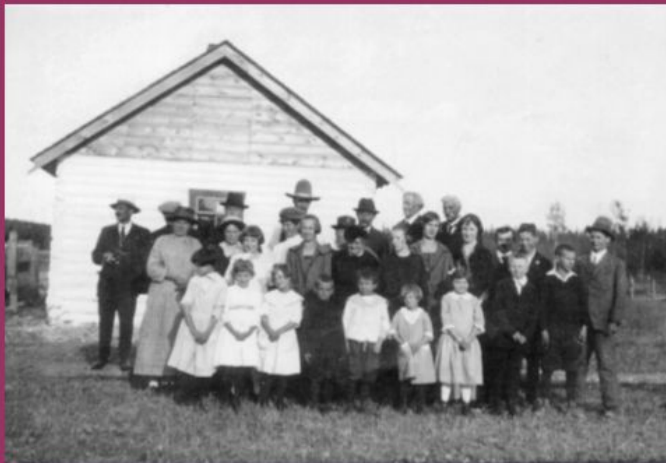
Beaverley Sunday School gathering or picnic