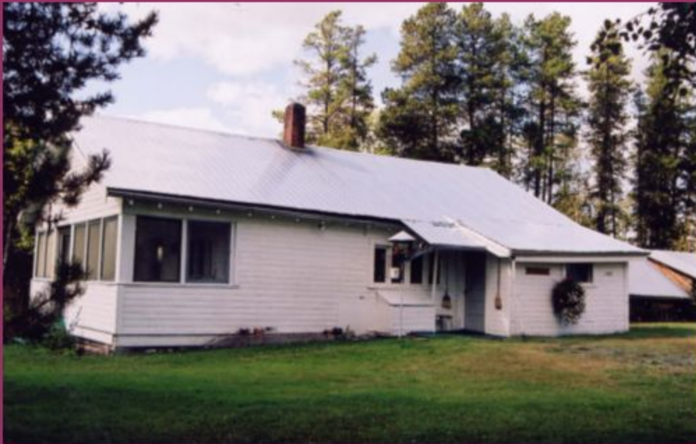
Henderson house built in 1918