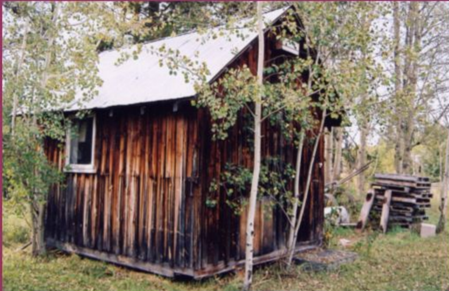
Henderson milk shed