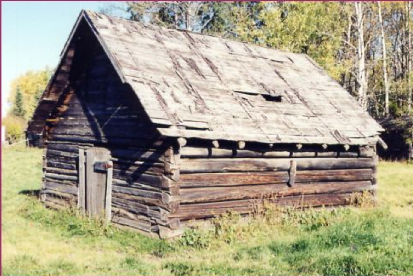
Barn at Teichmanns, possibly built by Dagey