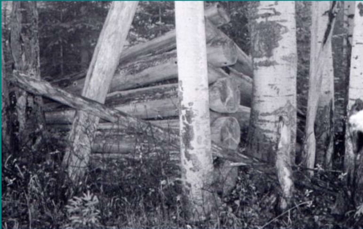
Remains of "Shorty" Haines cabin on Sunnybrook farm