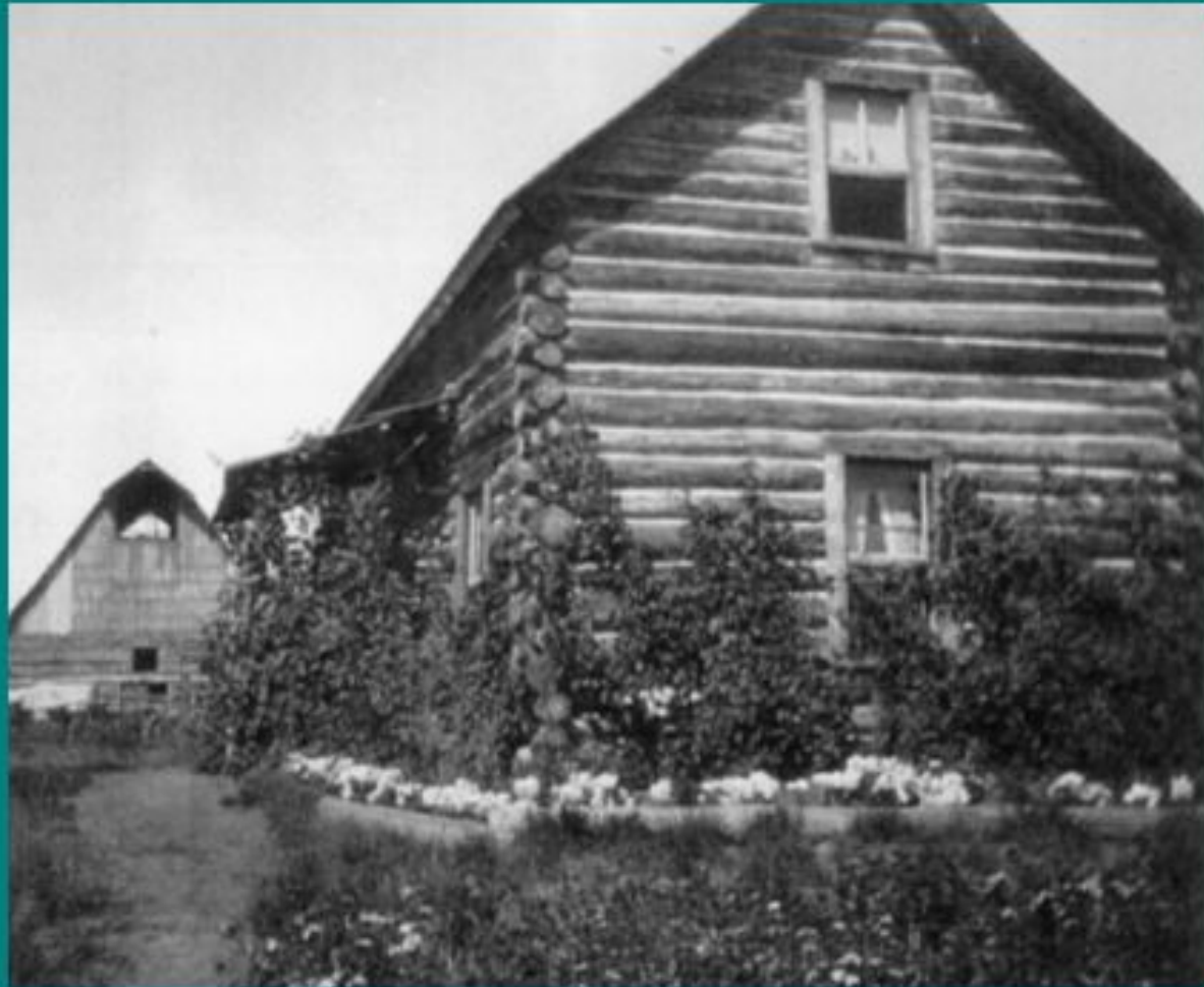
Simmons log house in the Giscome Portage area