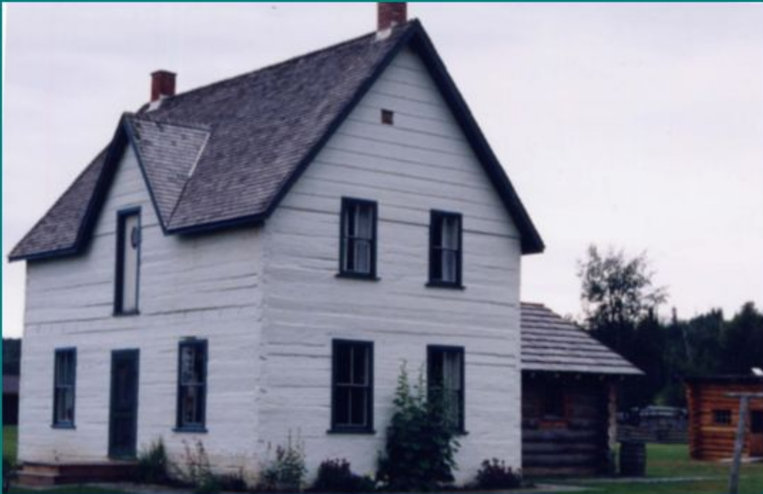
The restored Huble House in 1987