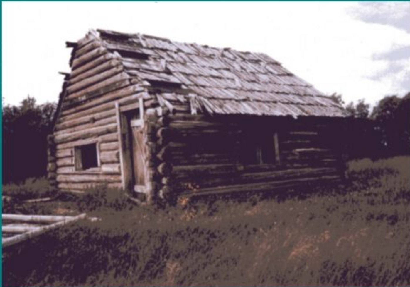
Ernie Wheeler's cabin