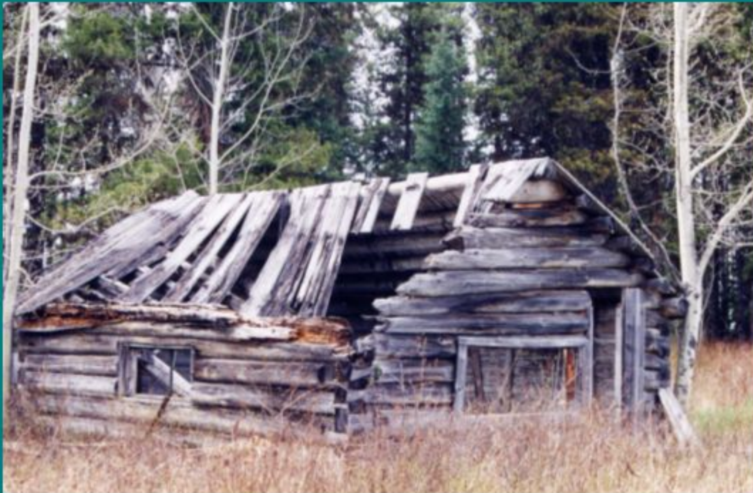
Jackson's cabin on Mitchell Road