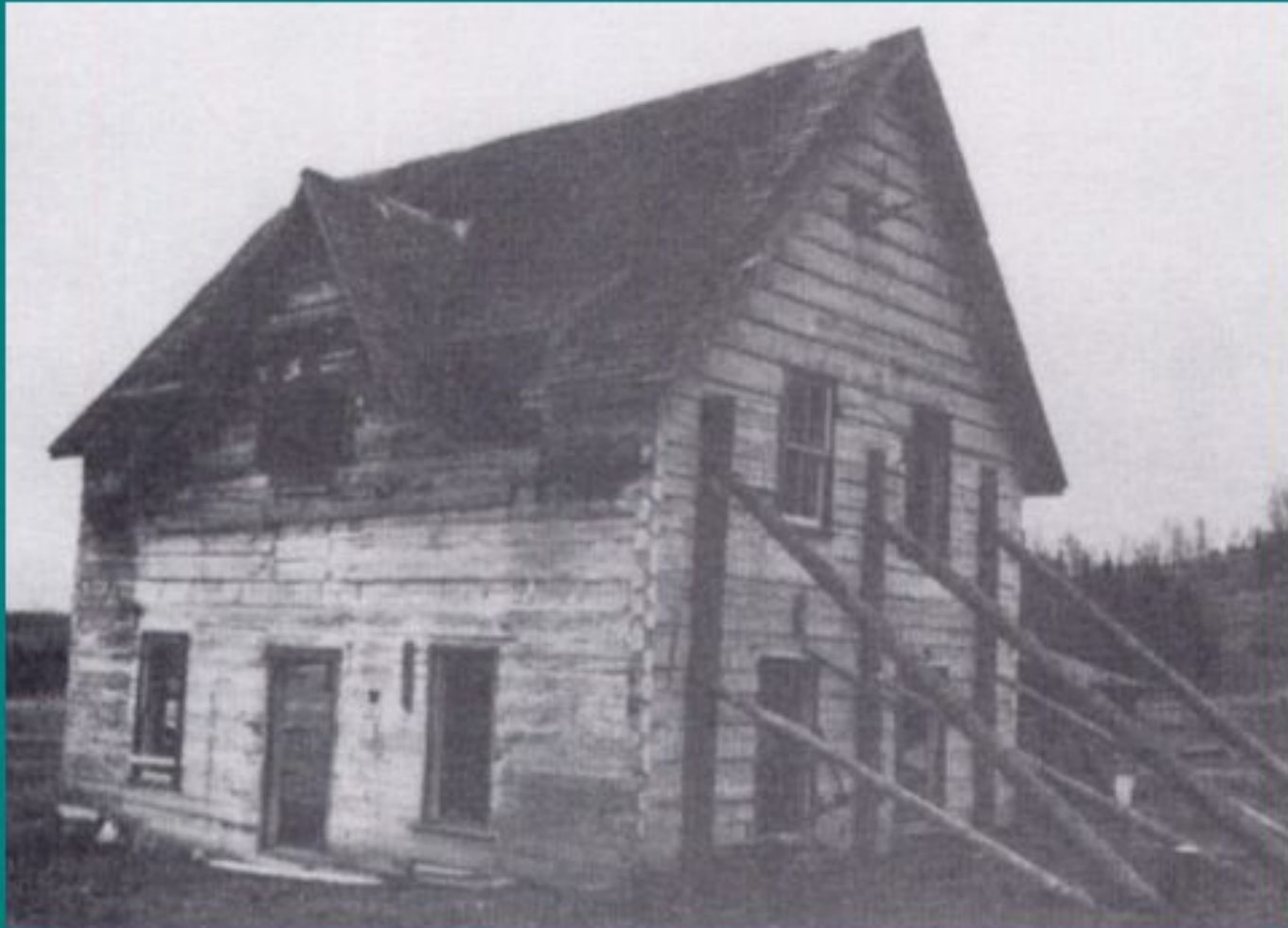
How the Huble House appeared in 1983