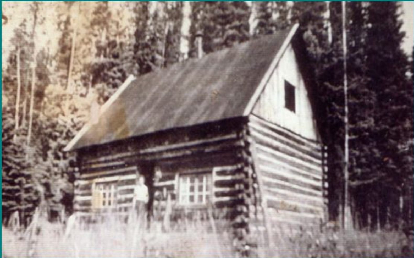
Erickson's main Cabin which they named "Honeymoon House"