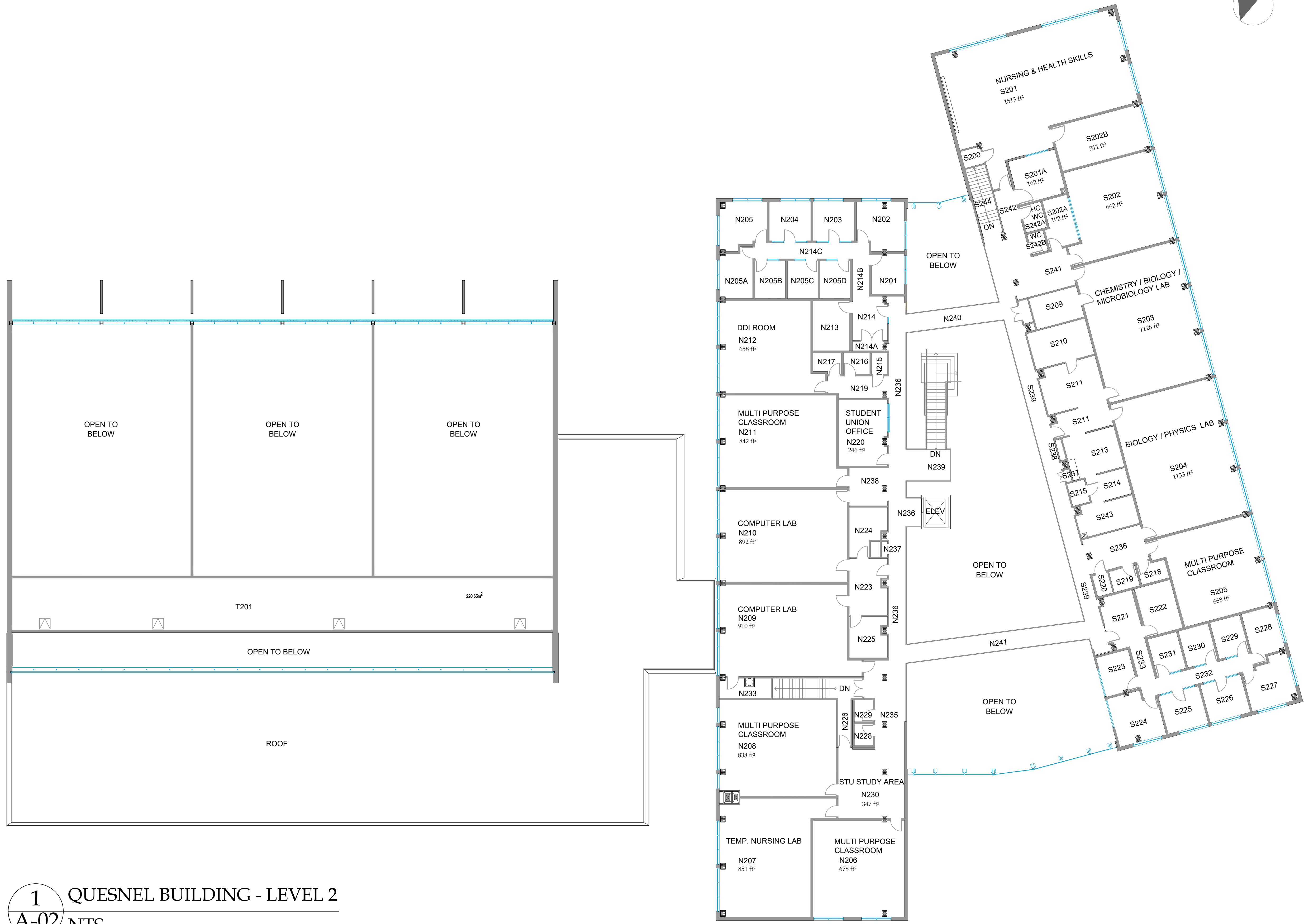
1 QUESNEL BUILDING - LEVEL 2 A-02 NTS